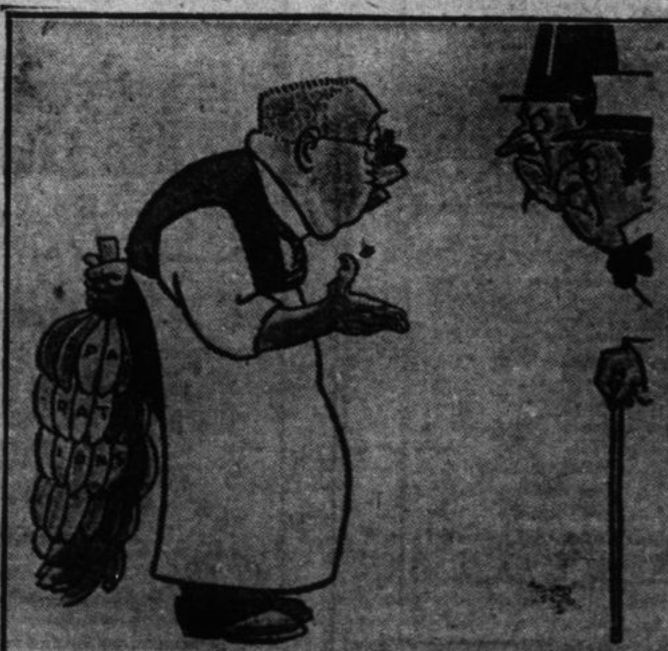
Yes, we have no bananas to-day.