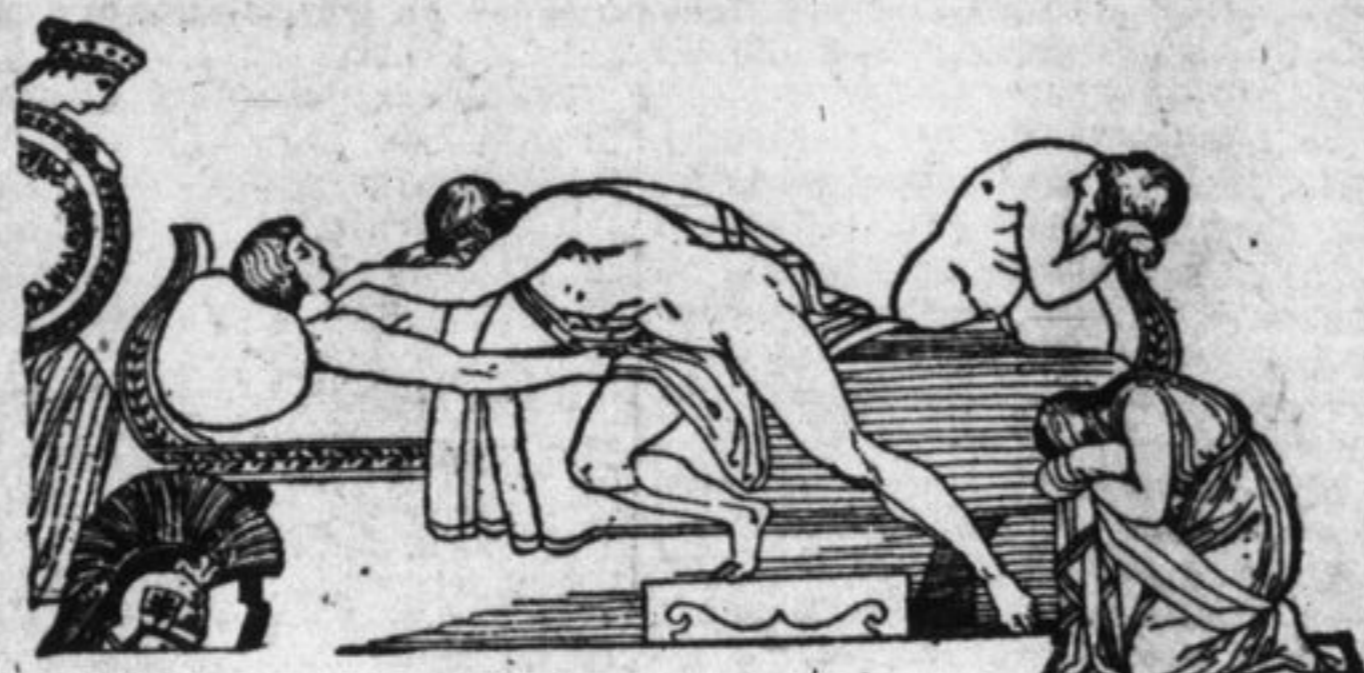
Achilles threw himself on the body of his friend and wept. At the left of the picture is a goddess who has brought new armor to the hero.

When Achilles learned of the event, he was overcome with sorrow, and threw himself on the body of his old comrade, weeping without stint.