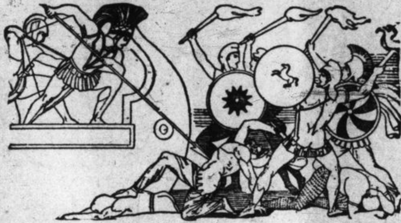
Ajax defending his ship against the Trojans.

Our picture shows Ajax fighting against the attacking Trojans. The Greeks drove their enemies back within the walls of Troy.