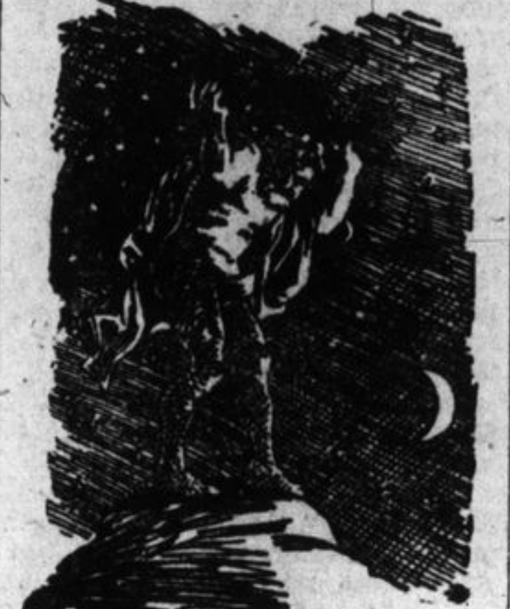
Here is Atlas holding up the sky. Some artists picture him with a globe around his neck; but that is foolish because the Greeks did not know that earth was round.

This myth of the Greeks is believed to have arisen from the tales of oranges in Spain. Oranges may easily have been called "golden apples" because of their color.