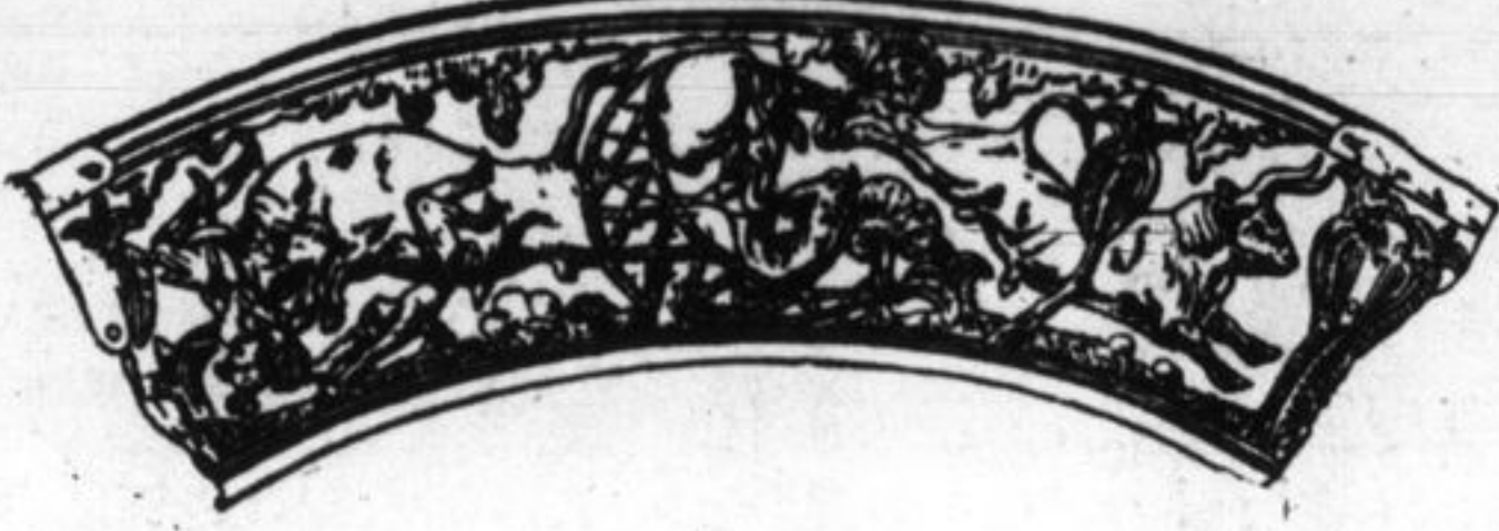
This is a drawing of the outside of a gold cup found in southern Greece. Bulls breaking loose and goring men are shown.