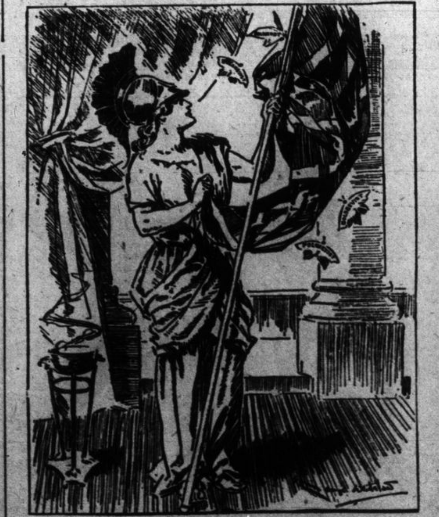
NO FEAR OF THE BOLSHEVIST MOTH. Britannia: "This good old flag is moth-proof." —From the Passing Show.