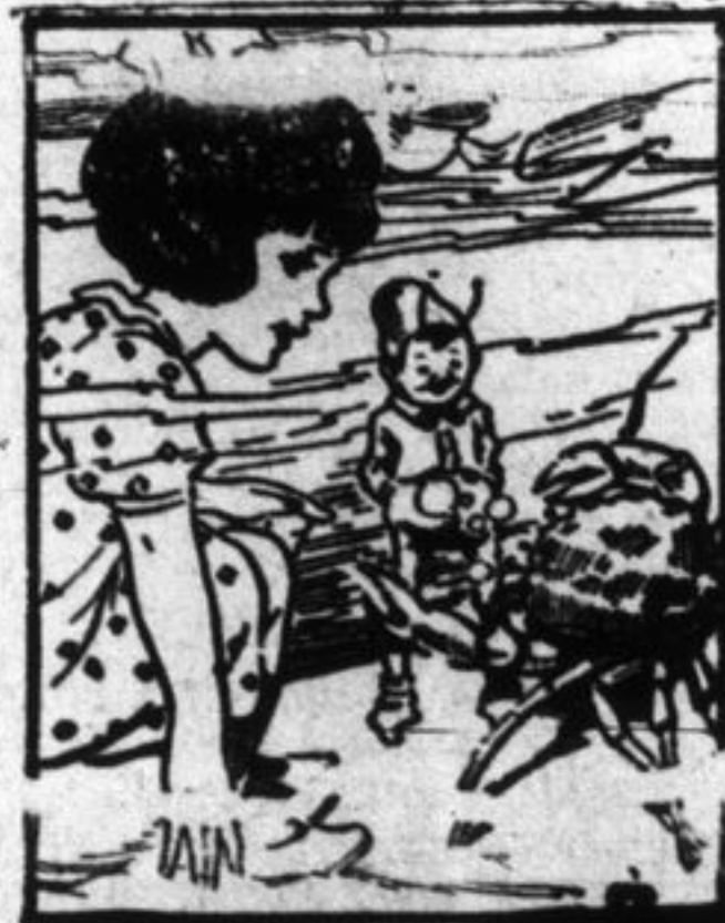
"Why Do You Have To Hide?"

dee. "I just want Dotty to meet you. You see, I caught Dotty with a frown on her face. Her mother called her in to change her dress." "Oh, pshaw!" chuckled Mrs. Crab. "If you lived in my family, you might have some cause to complain. But, my goodness! You can change yours in a jiffy, while Daddy Crab and I—well, it takes a long time for us to change our dresses. That's why we are in hiding now." "Why do you have to hide?" Dotty asked. Then she saw Mrs. Crab's shell wasn't hard like she always thought it was.