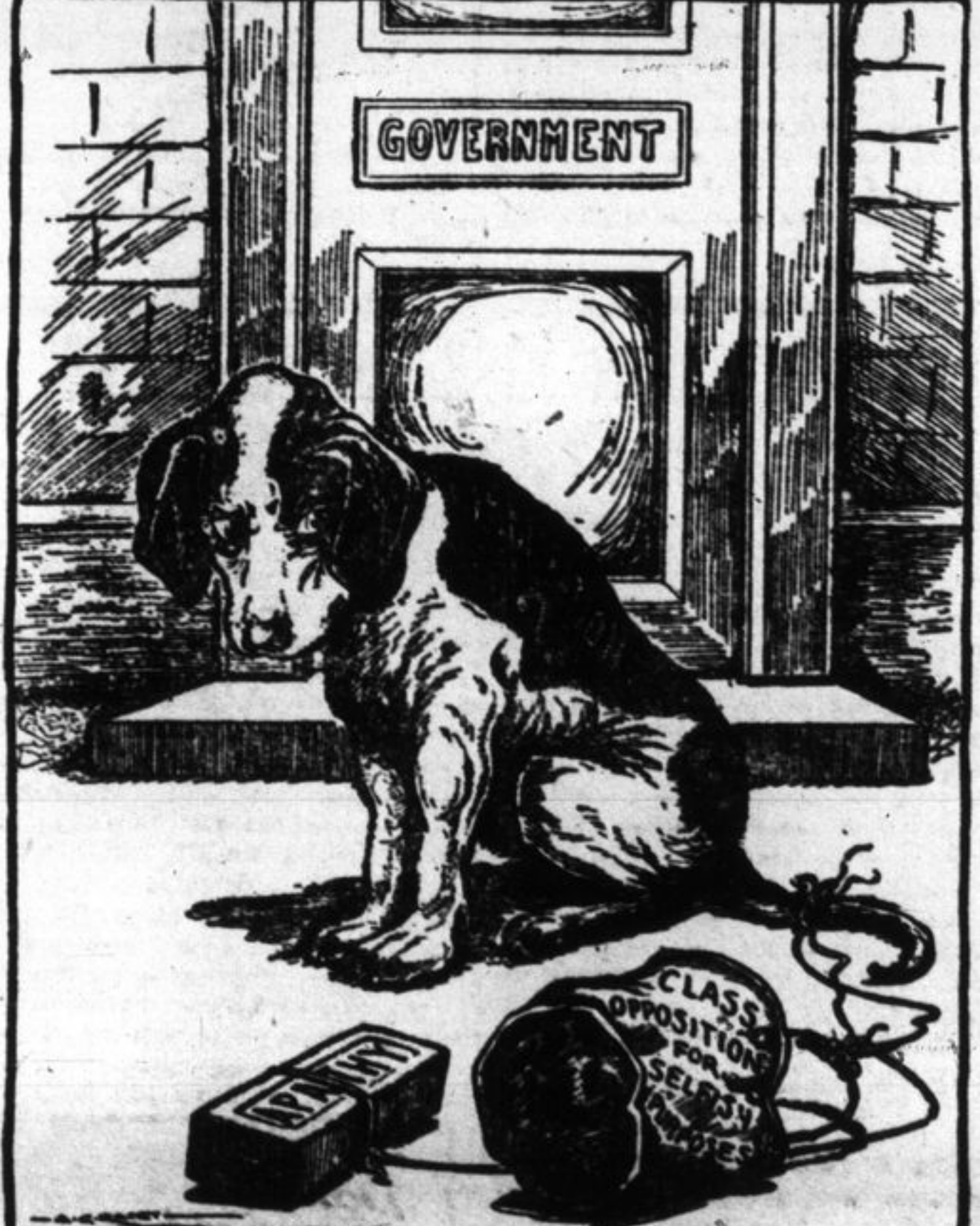
The promising young 'un—Fancy out of a master I have to have the tin can there and do a trick on my tail hook.