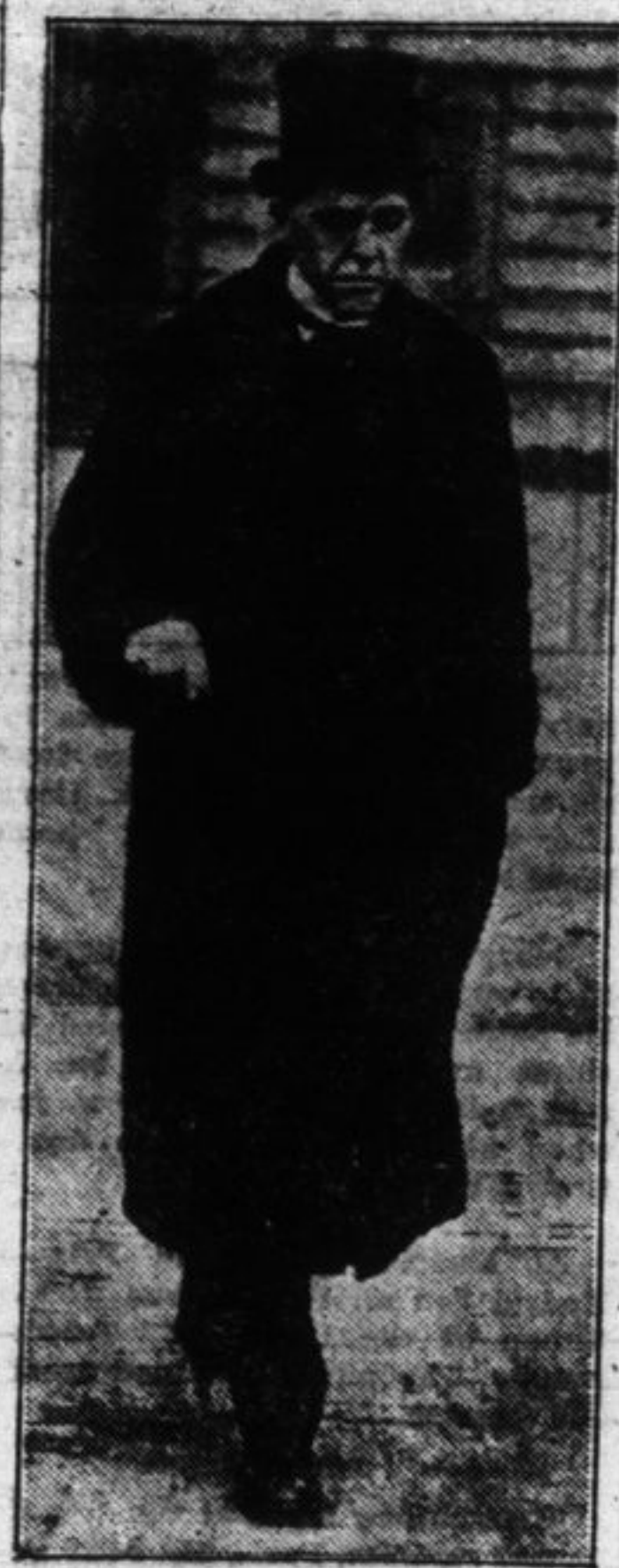
LORD BIRKENHEAD Recently made some startling statements concerning the French air forces, which he said were large enough to seriously menace the safety of the British Isles.

The appearance of British warships off the Russian shores has made an impression upon Soviet Russia.—From the Sunday Chronicle.