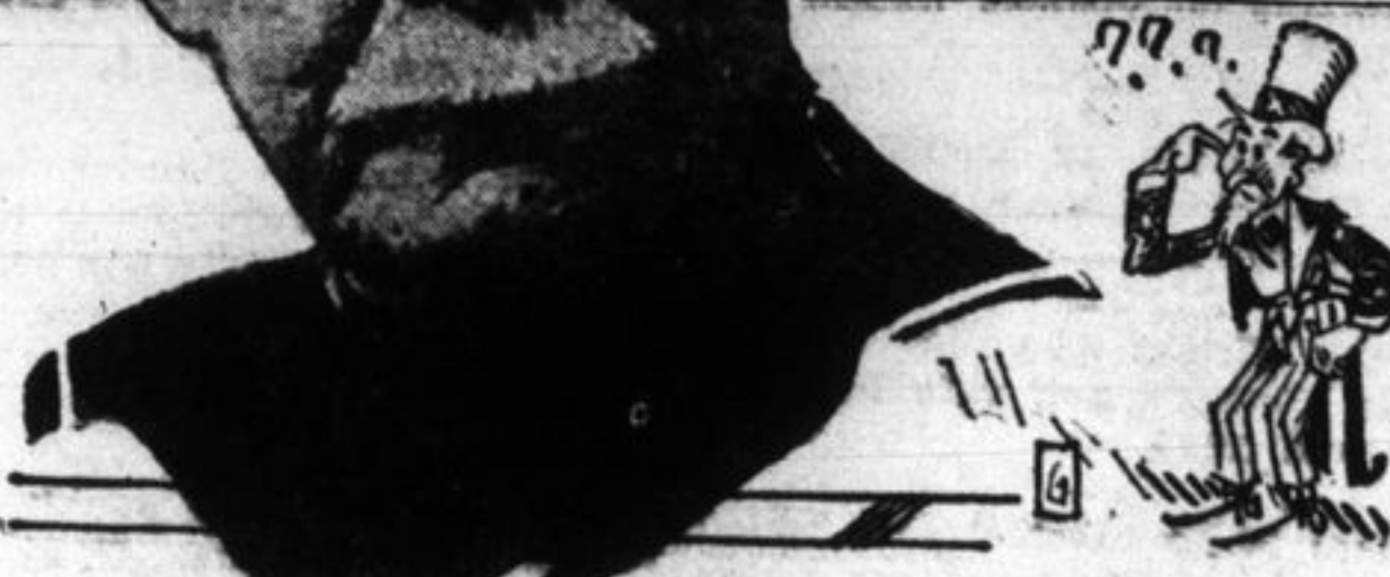
REAR ADMIRAL COLBY M. CHESTER AND NEW PHOTO OF MOSUL, WHICH PROMISES TO BE CENTER OF INTERNATIONAL COMPLICATIONS.

WASHINGTON—America will virtually control the rehabilitation of Turkey if the "Chester Plan" is carried out. The Turkish Nationalists have given a 2,400 mile concession for developing oil fields and railroads in Asia Minor to Rear Admiral Colby M. Chester, retired American naval officer, but France has already warned Secretary Hughes that she will not recognize the concession, while England is expected to be firm in her opposition. All signs indicate that these Mosul oil fields will push much international trouble.