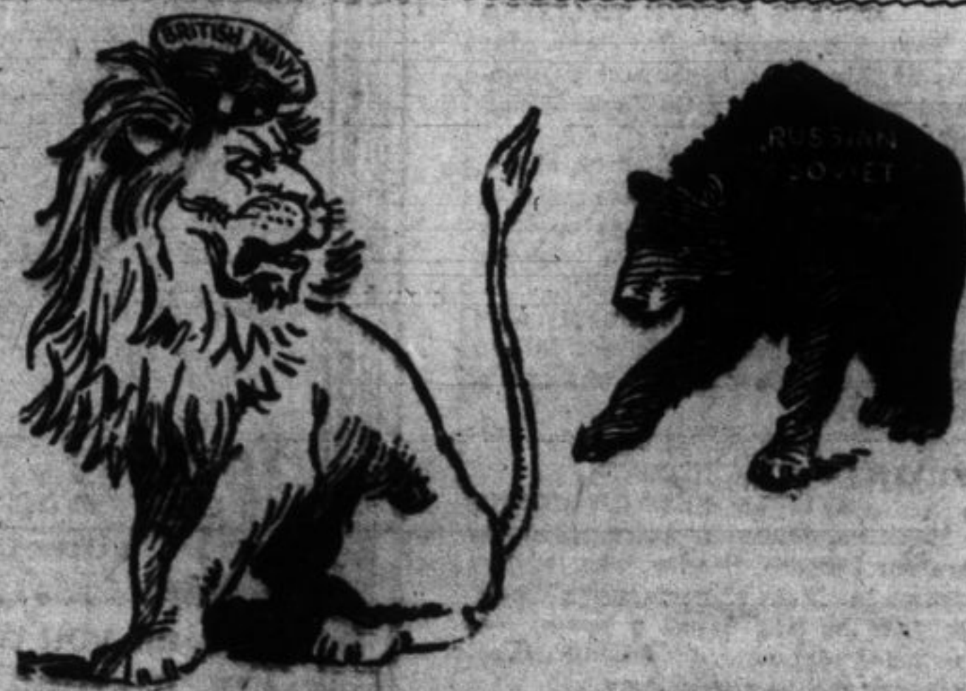
THE LION: "STOP TWISTING!"

NEW YORK—The busy New York business man can now run out to Chicago and back by air for the simple sum of $5! The "air flivver" has made it possible. Georges Barbot, French ace, inventor of the new small plane called the Derwontine Motor-aviette, which he is now demonstrating in this country, has been able to make 125 miles on a gallon of gas. At this rate, the owner of a "flying flivver" could fly to San Francisco from New York for a total expenditure of less than $50.