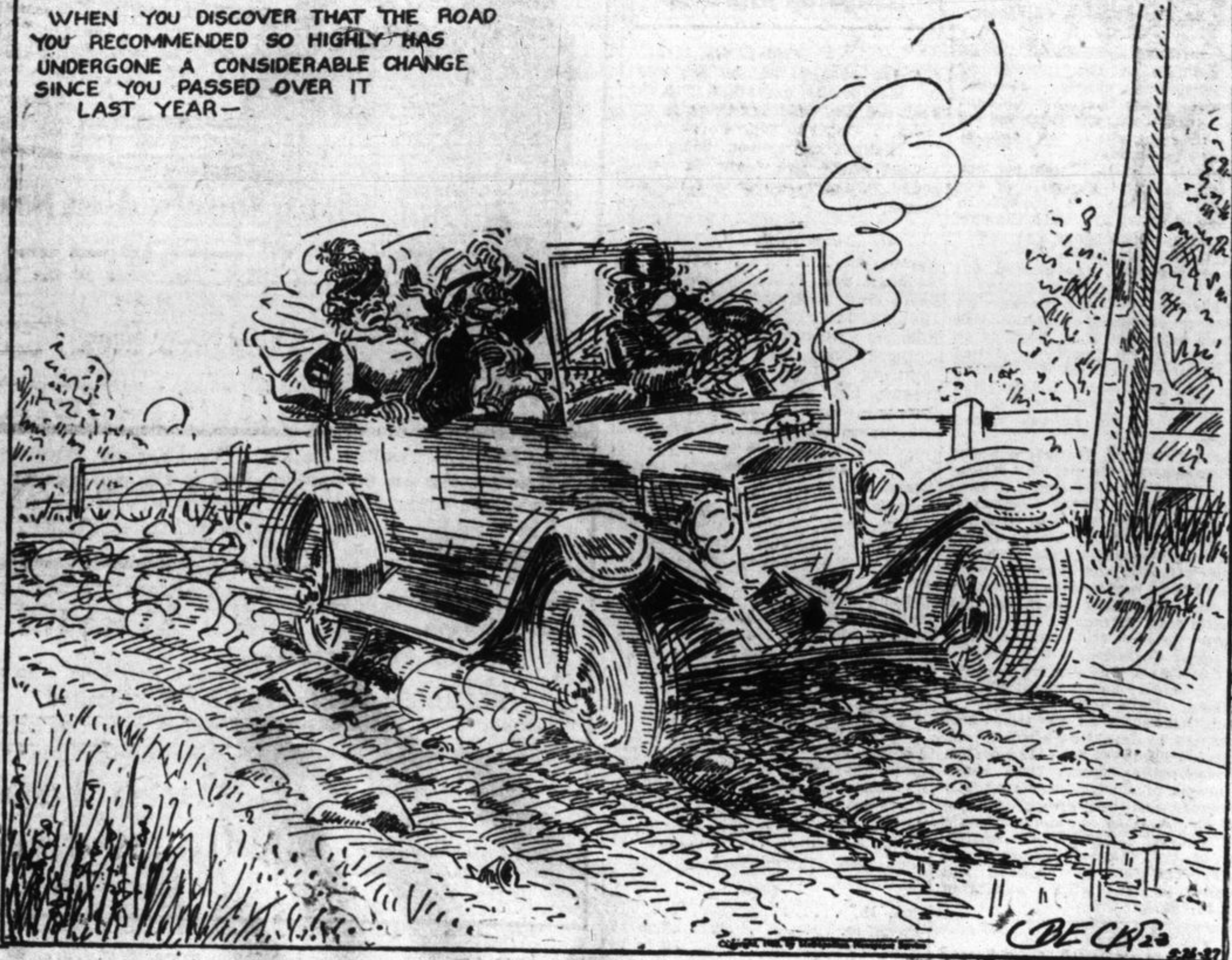
EMBARRASSING MOMENTS OF A MOTORIST.

WHEN YOU DISCOVER THAT THE ROAD YOU RECOMMENDED SO HIGHLY HAS UNDERGONE A CONSIDERABLE CHANGE SINCE YOU PASSED OVER IT LAST YEAR—