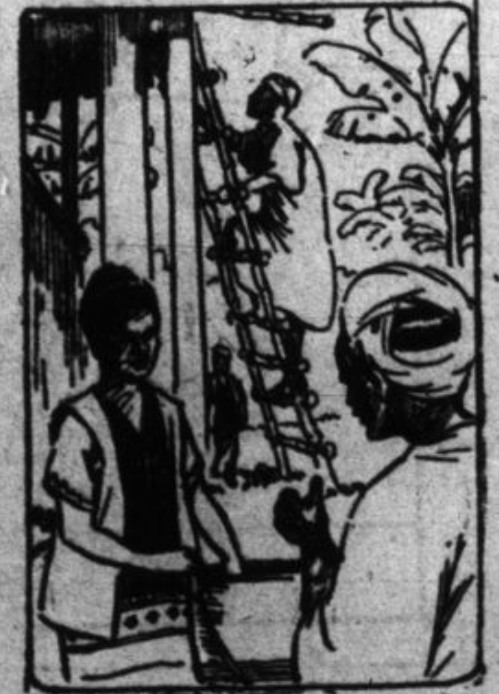
A Burmese Karen House.

But they are not huge structures built of steel and cement—they are