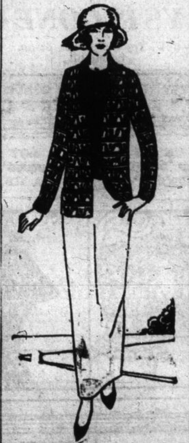
A Jacket of Blue and Sand and Skirt of Sand Color Make Up This Chic Knitted Suit.

Knitted garments promise to enjoy increasing popularity this season. Women of fashion have found them as comfortable as they are smart, and with this double stamp of approval the dress and suit of