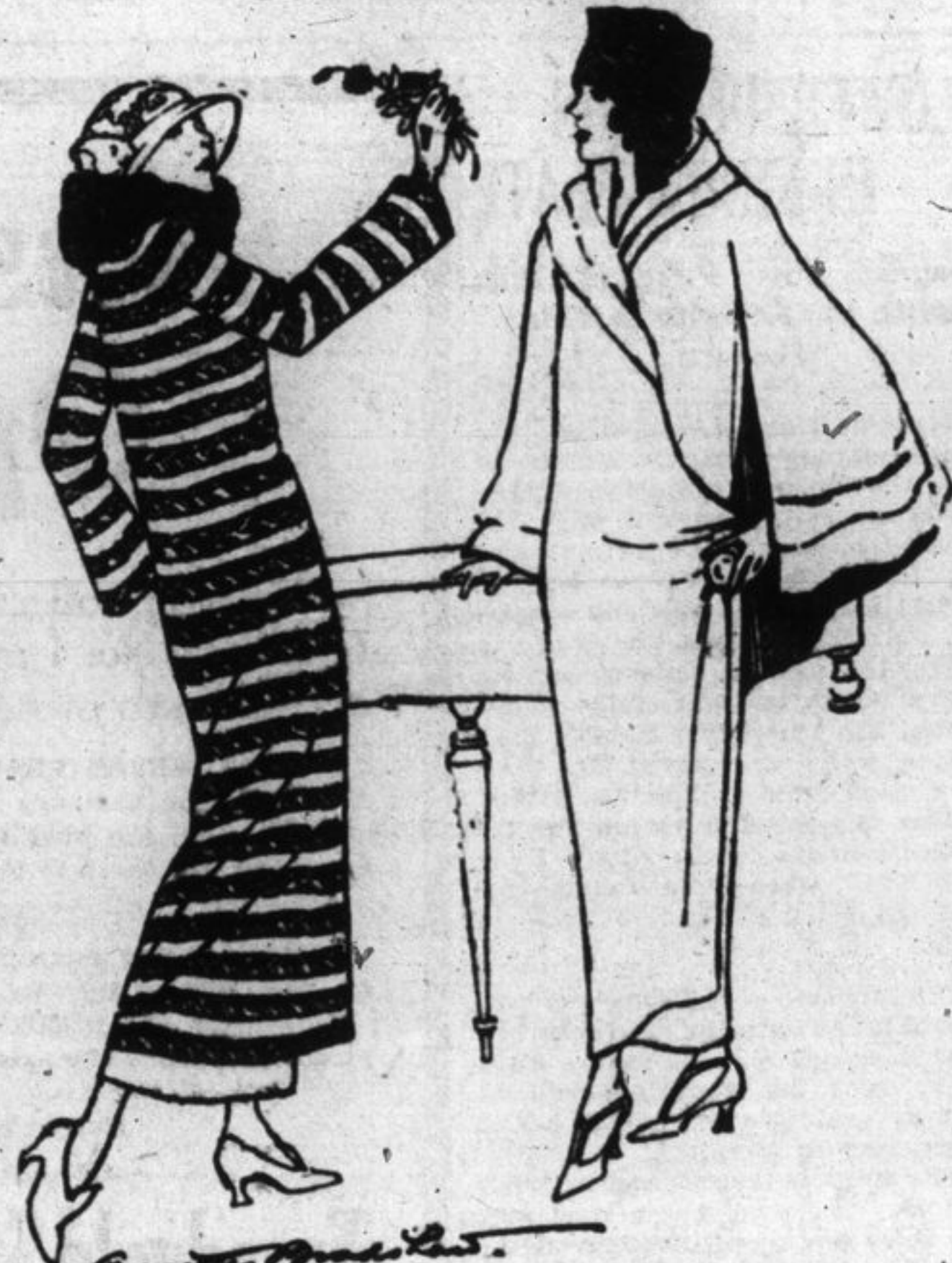
This Wrap of Black and White Printed Broadcloth is Collared in Fox. Camel-Colored Kasha Makes This Wrap-Over Model with a Cape Back.

From Your Head to Heels You're Cozy and Smart in the Newest Models