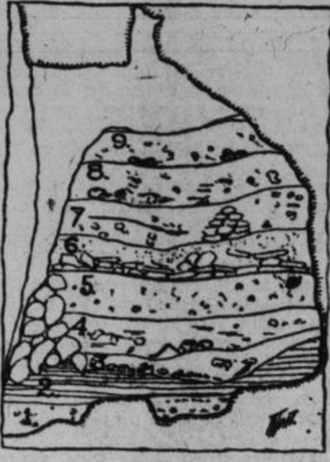
This diagram shows how Nature has preserved a wondrous history in one of the caves of Europe. Next—Pressing Stone with Bone.