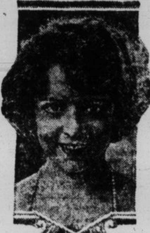
Colleen Moore in the Paramount Picture "The Nth Commandment" A Cosmopolitan Production