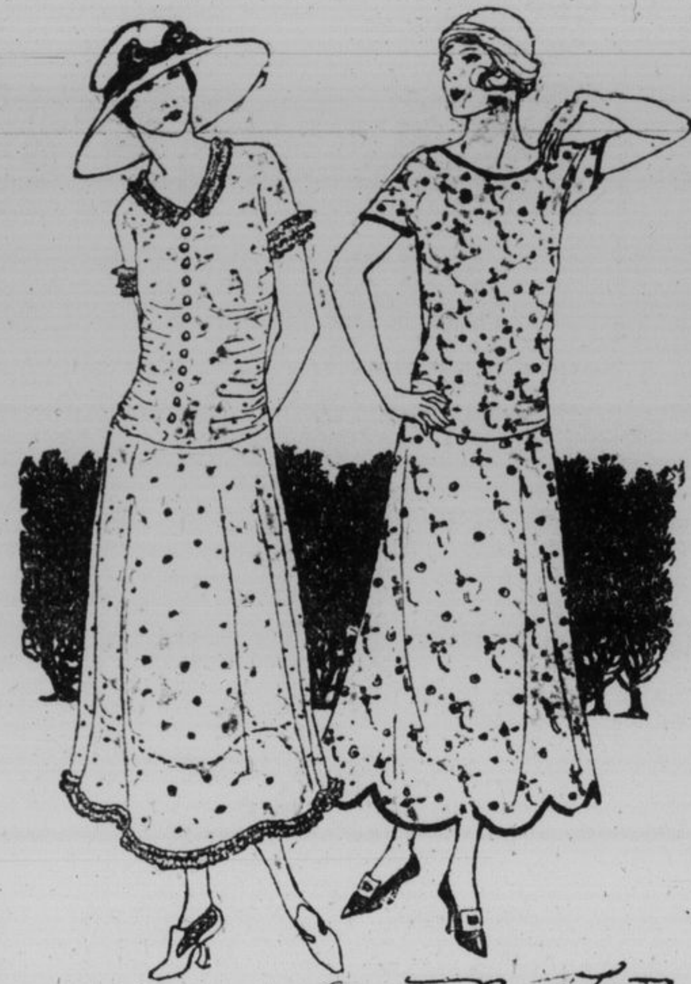
This White-Dotted Swiss Is Trimmed This Deep Orange Calico Is Figured with Yellow and White Lace.

A hypocrite never succeeds in misleading others as far as he misleads himself. Idolize a woman if you will, but don't try to understand her. Have faith in your friends if you will keep them faithful.