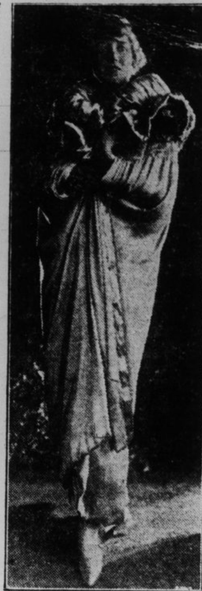
A CLOAK FOR BRIDES Something entirely new for the bridal trousseau is a cape of hyacinth pink baronet satin with tinted peonies under the draped bolter collar.

The brave fellows were singing "John Brown's Body." Mrs. Howe