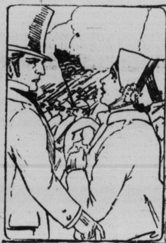
"You Ought to Write Some New Words to That Tune."

And always on these occasions she was asked to head her splendid "Battle Hymn of the Republic," which she had been inspired to write,