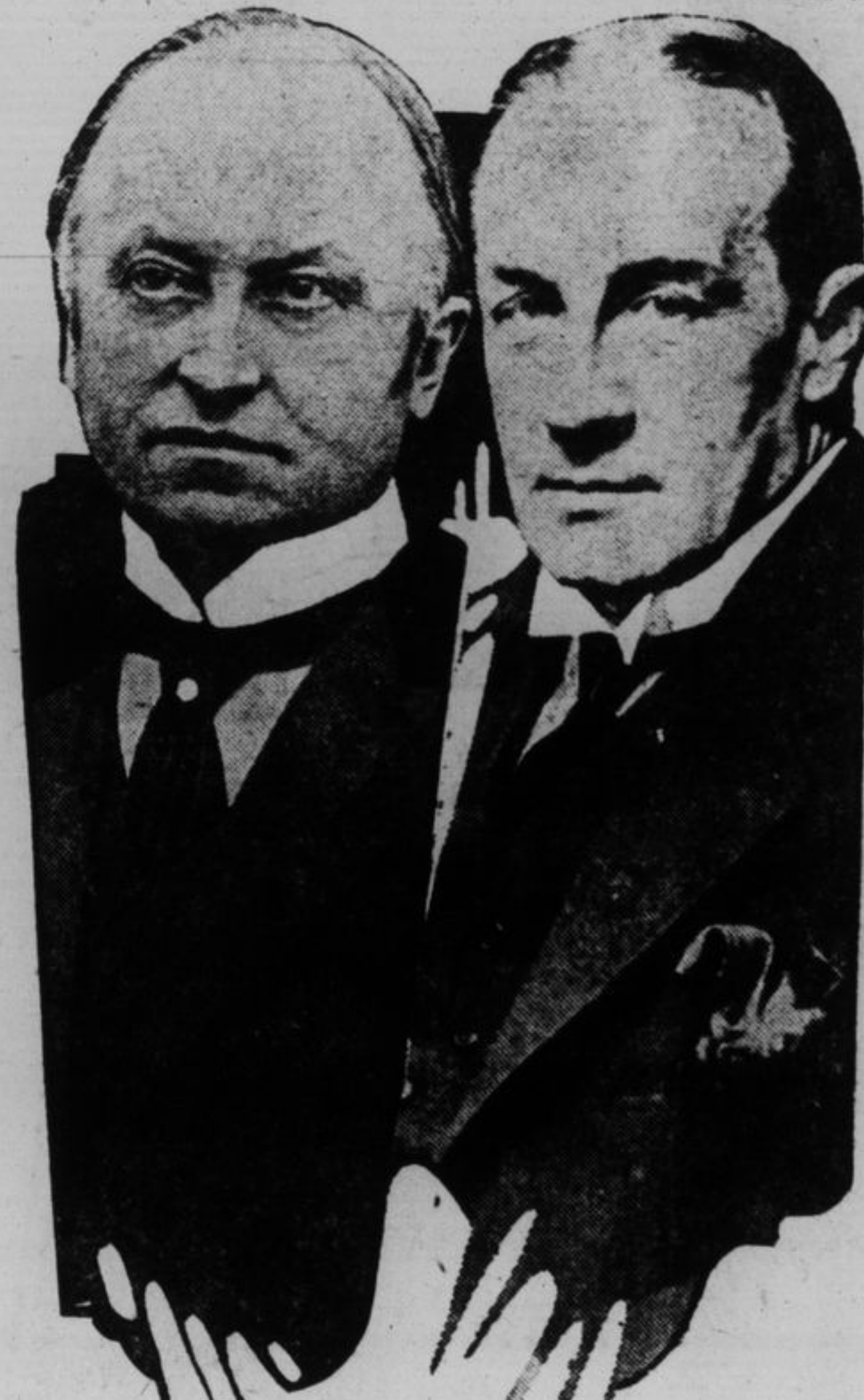
Lord Curzon (left) named by Bonar Law, and Stanley Baldwin (right) popular chancellor of exchequer.

London, April 24.—The Hon. Stanley Baldwin, known to Americans as the shrewd head of Britain's debt funding delegation which visited the United States in January, has been picked by keen political prognosticators as the most likely candidate to succeed Bonar Law, whose days as British premier are said to be few.