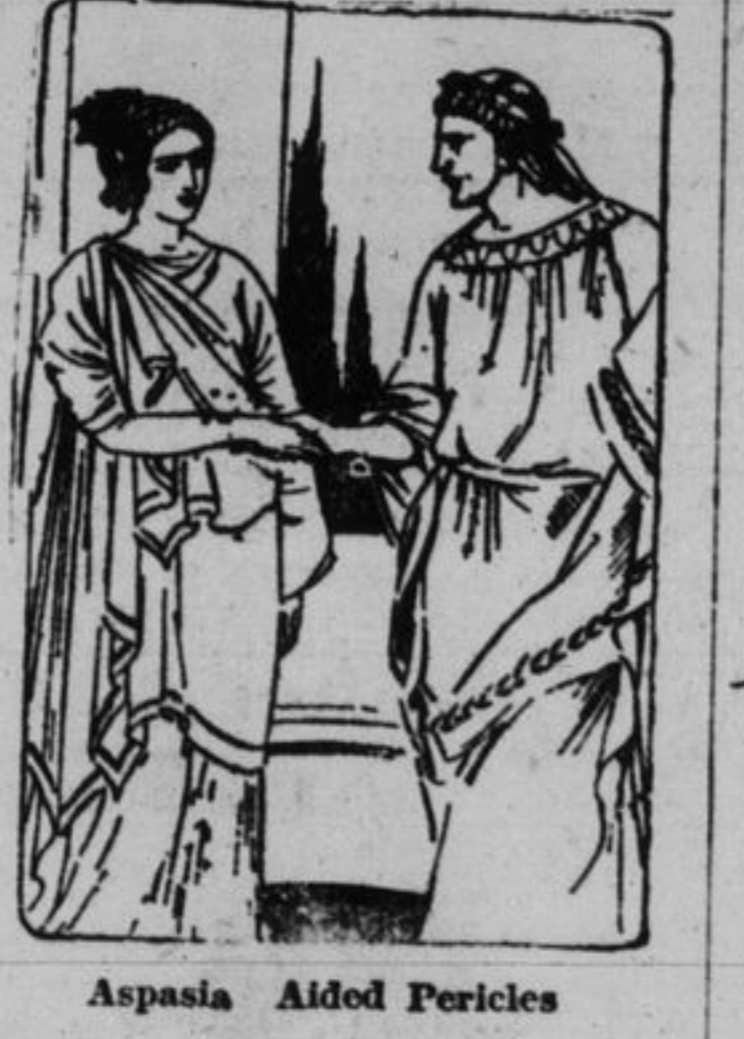
Aspasia Aided Pericles