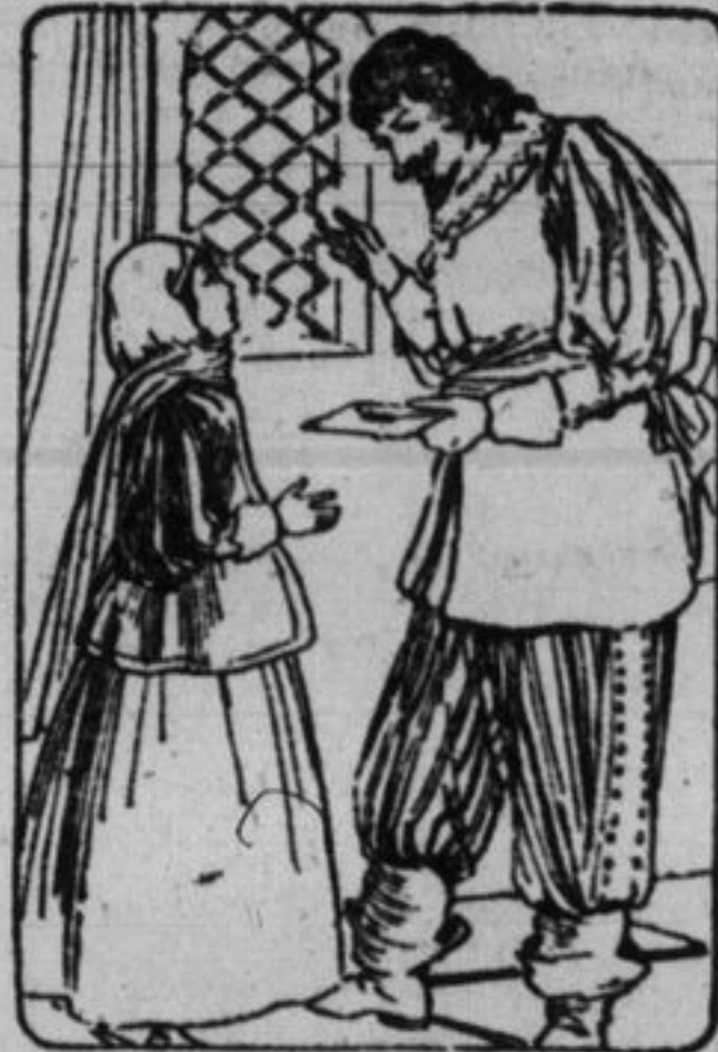
Lady Grizel Was His Messenger

For a little girl had been born to Sir Patrick and Lady Hume. Amidst much joy and happiness, this baby was christened "Grizel." What a comfort and help this child was to be to her father in a few years! And how proud her parents were to be of her talents and achievements