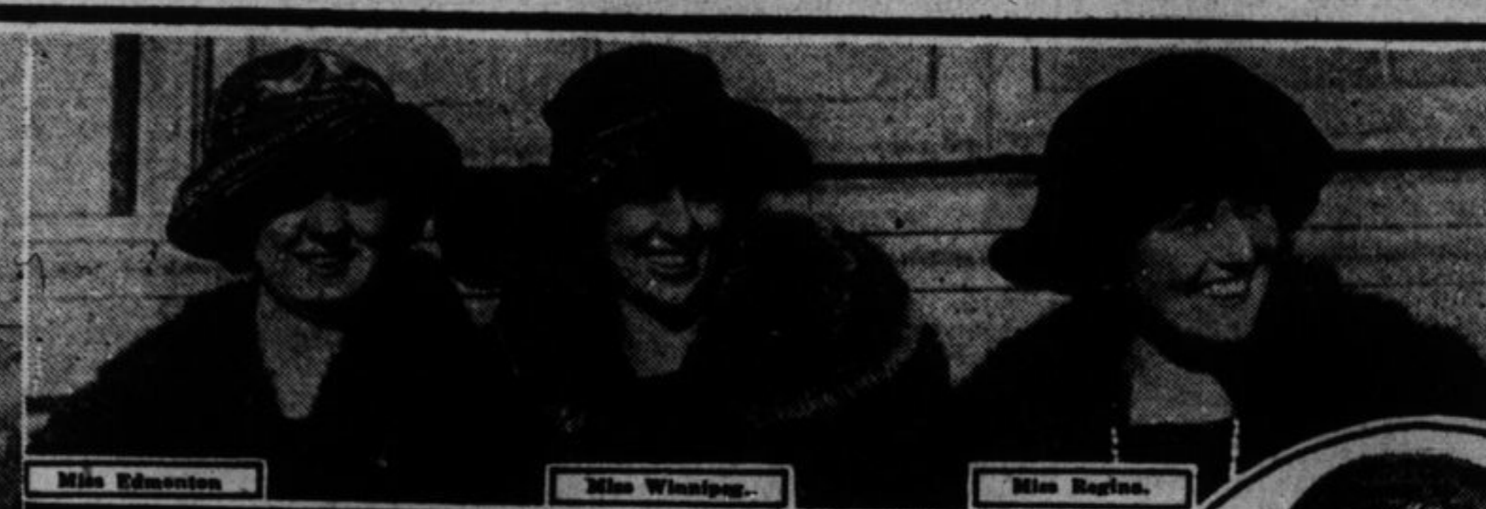
Western beauties in Montreal for the winter carnival.