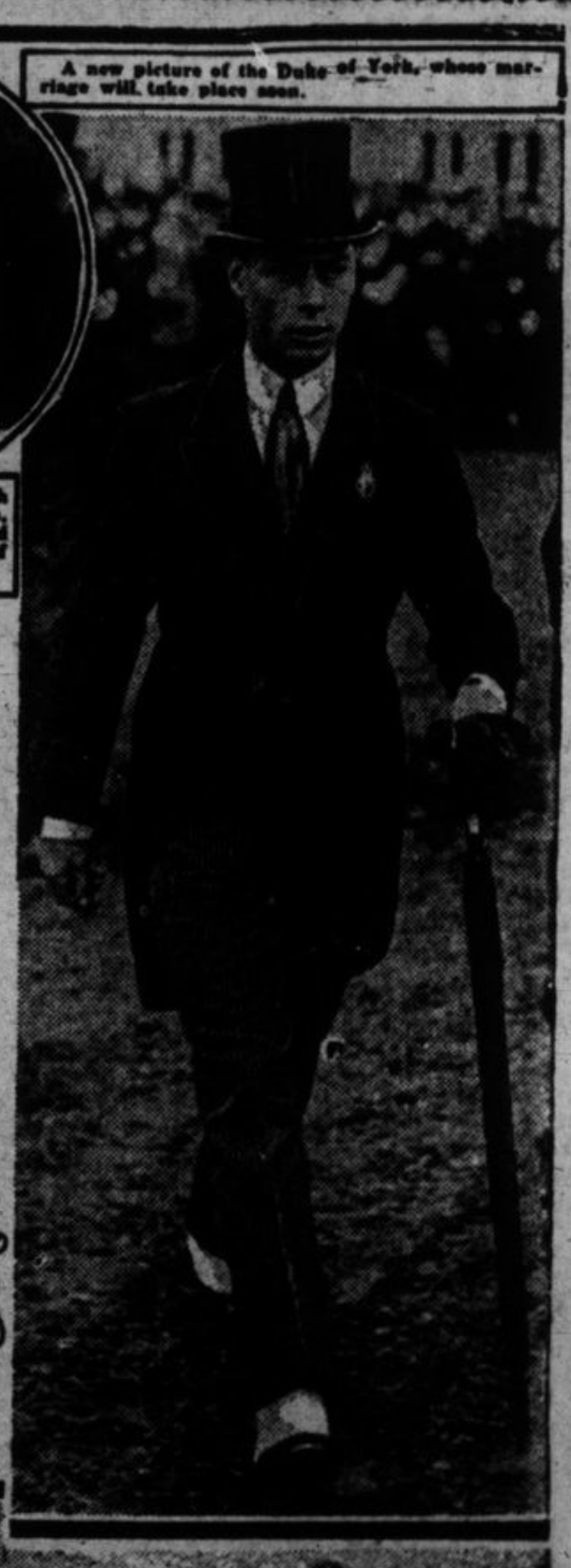
A new picture of the Duke of York, whose marriage will take place soon.