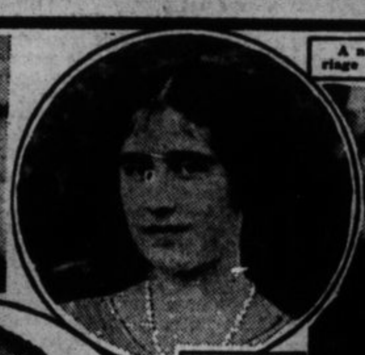
Lady Elizabeth Bowen-Lyon, the betrothed of the Duke of York.