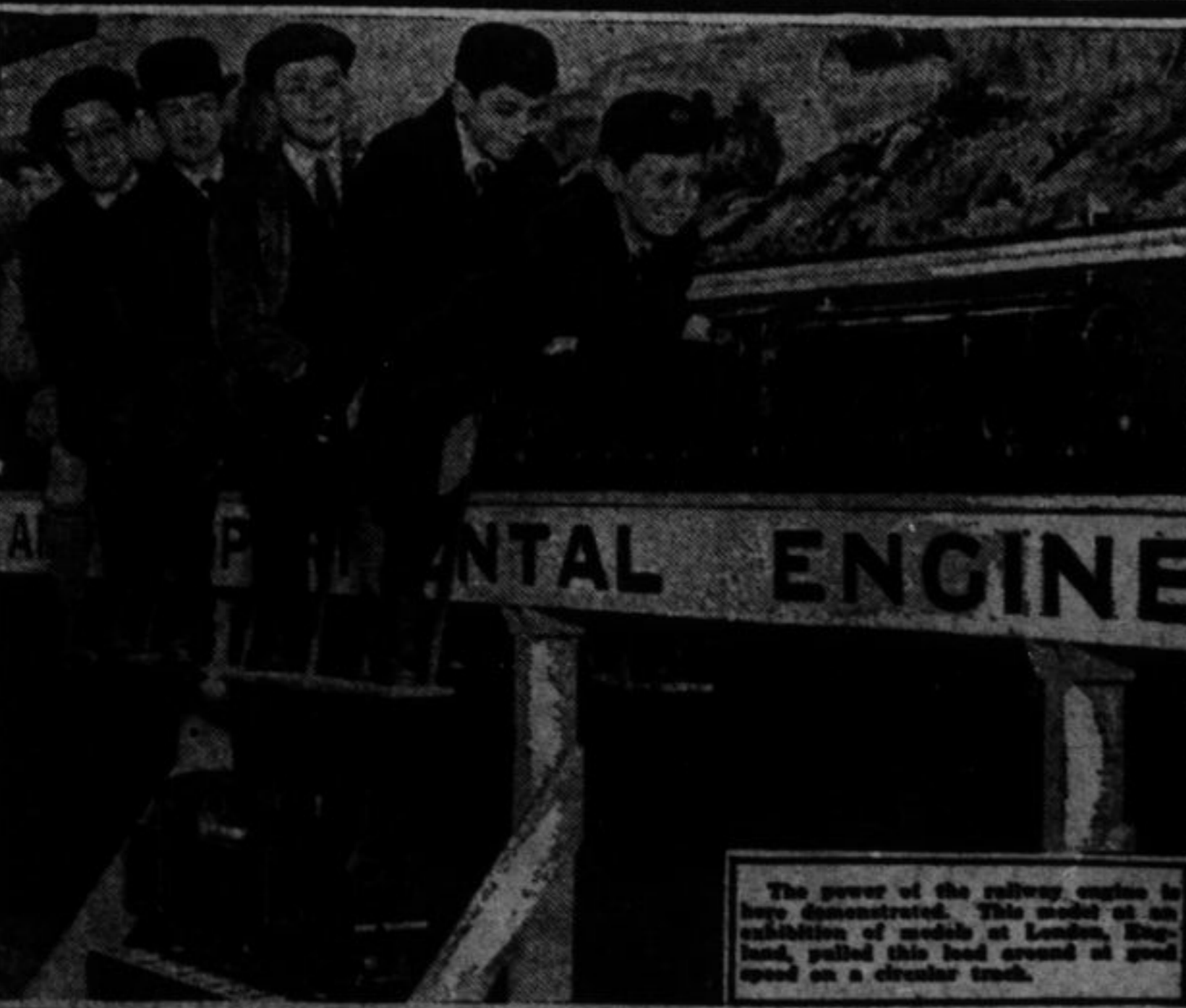
The power of the railway engine is here demonstrated. This model at an exhibition of models at London, England, pulled this load around at good speed on a circular track.