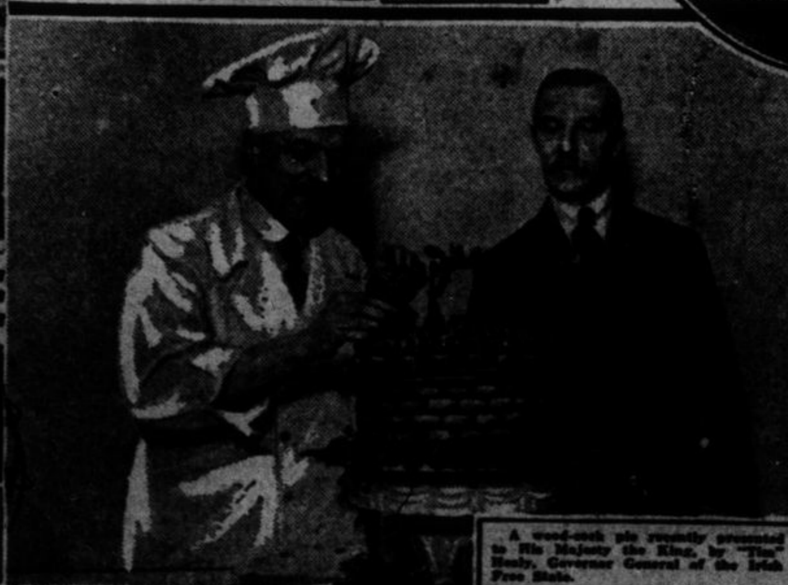
A woodcock was recently presented to His Majesty the King, by "The Duke," Governor General of the Irish Free State.