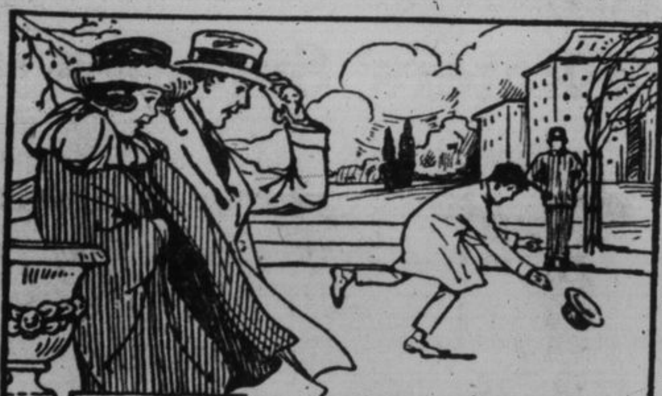
"When the stormy winds do blow"

So goes the old sea song, and it would be good advice to add