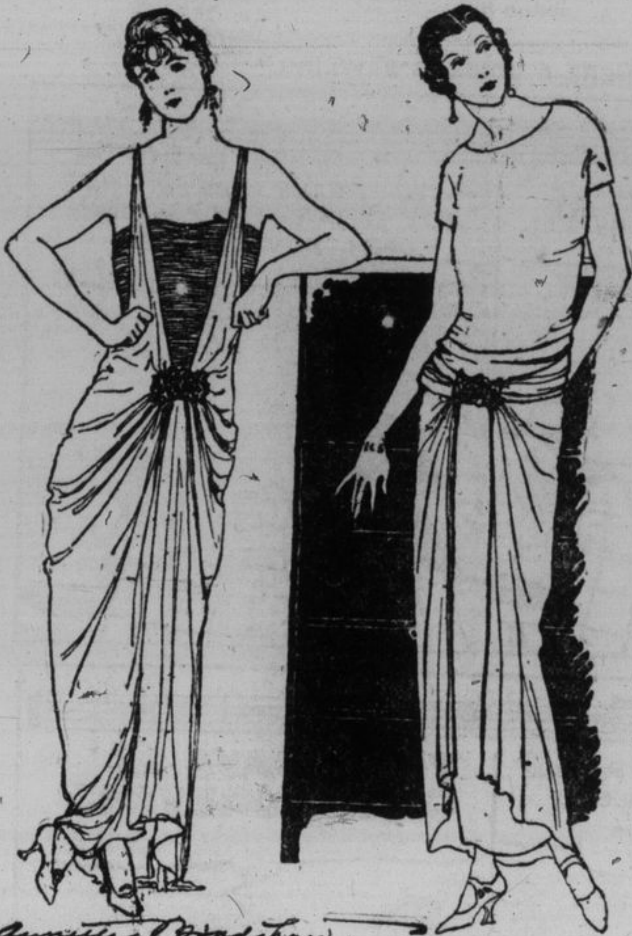
Note the Upward Trend of the Drapes on These Charming Dresses.