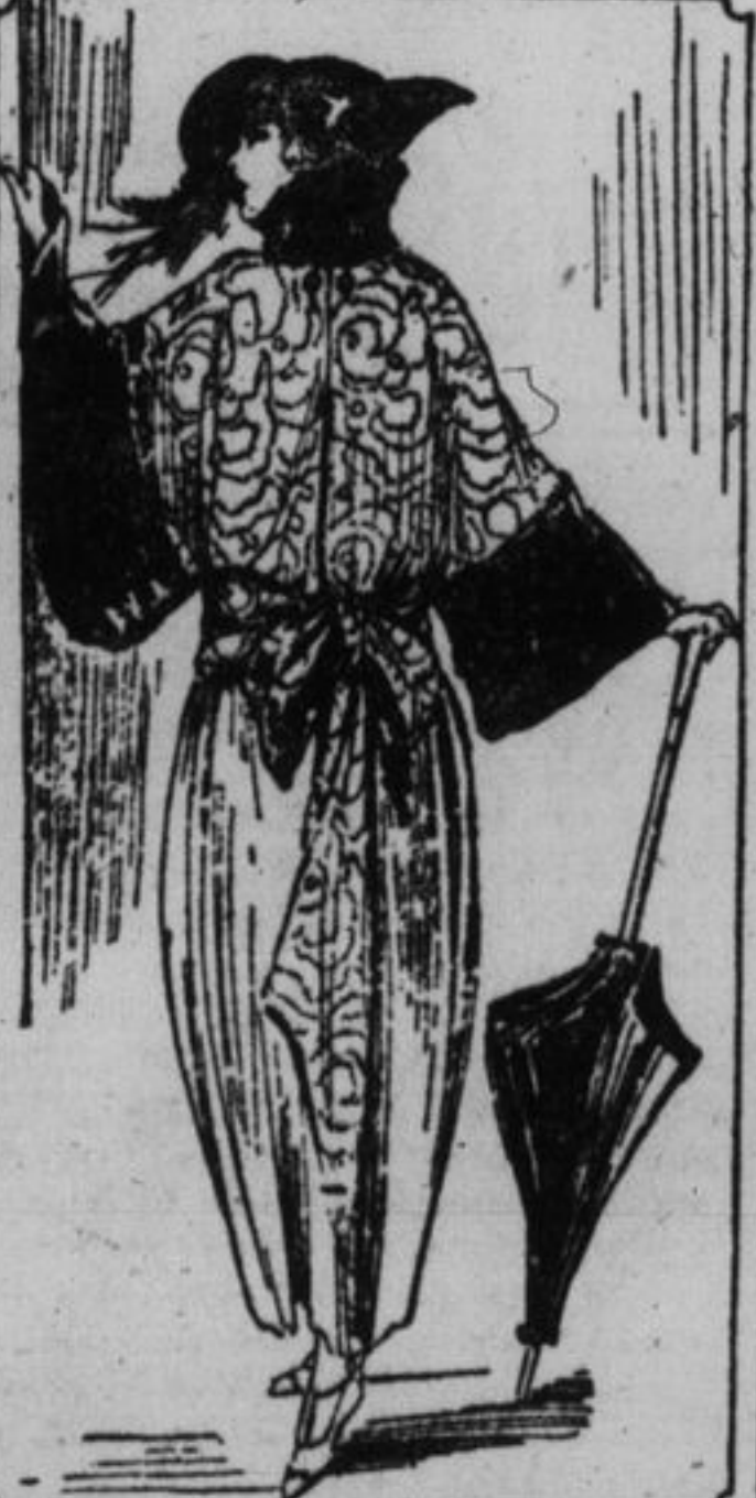
Winter Wrap of Seal Brown Stitched Silk and Seal Fur.

What you learn to your cost you may remember longest.