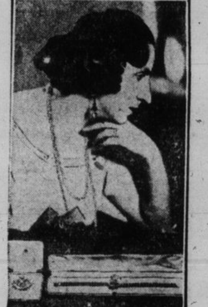
AMELITA GALLI-CURCI Prima Donna, narrowly escaped death when her car overturned near Newark. Later the same evening the car just missed an open draw-bridge.