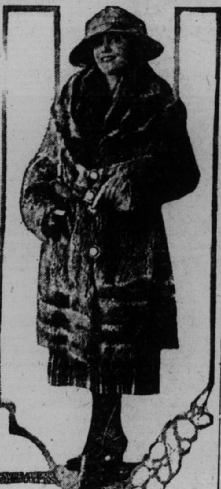
For motoring and under all conditions when durability is required, nothing takes the place of the raccoon fur coat.