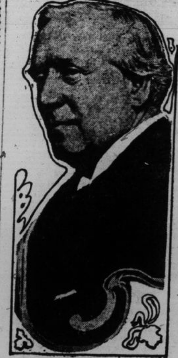
H. H. ASQUITH He denies that his wing of the Liberal party is flirting with Bonar Law with a view to a new coalition in British policy.

The illustration shows one of the new Moffat 1922 models—a masterpiece of range building. MOFFATS ELECTRIC RANGES FOR SALE BY The Public Utility Hydro Shop 208 Princess St., Kingston, Ont. Phone 344