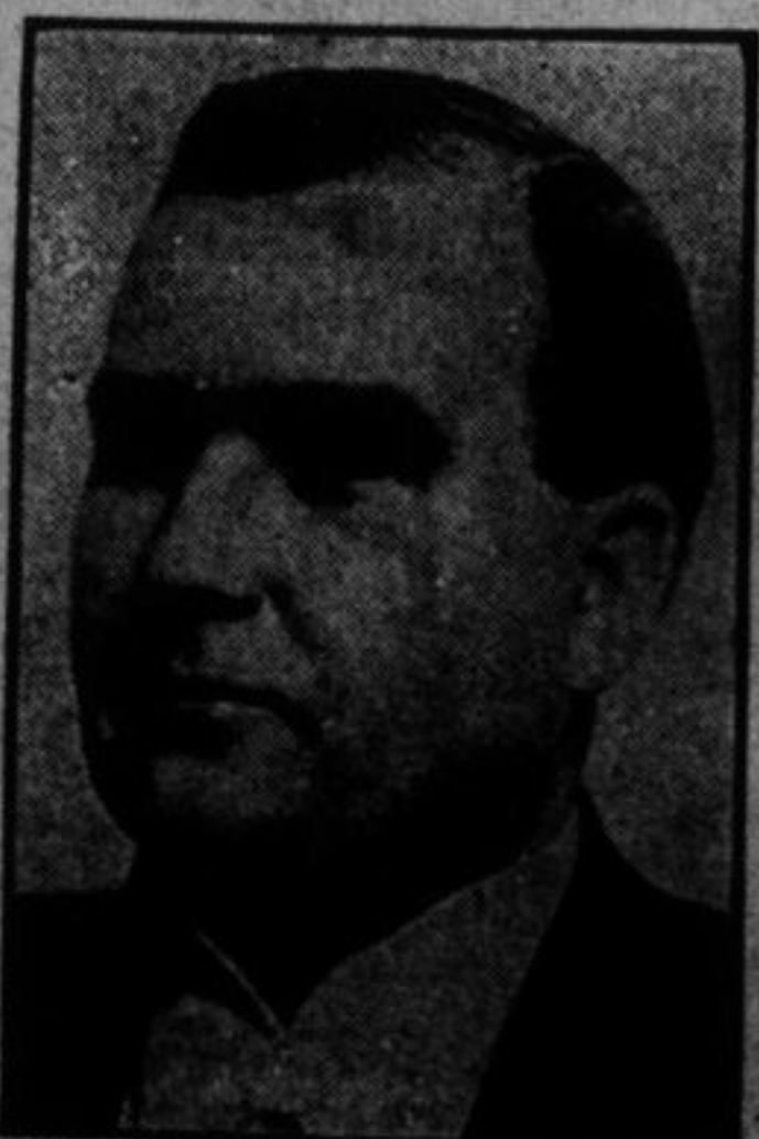
ANDREW J. VOLSTEAD, Speaker of the American dry law which bears his name, had a close run for re-election to Congress.

For some years prior to the time when he went out to Africa he was engaged in medical mission work in Labrador. In Africa, through his practical work, he was held in the highest esteem by the various governments and held posts of importance.