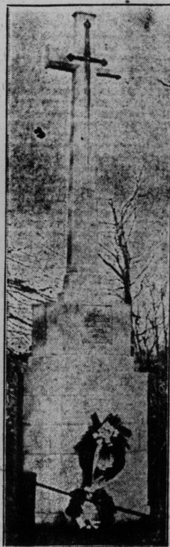
MONTREAL'S CROSS OF SACRIFICE This memorial was unveiled this week in Montreal at a unique ceremony in which French and English united, with clergy from both Protestant and Catholic churches. The cross stands in the military plot between the Protestant and Catholic cemeteries, and has inscriptions in the two languages.

trade his present car for another woman.