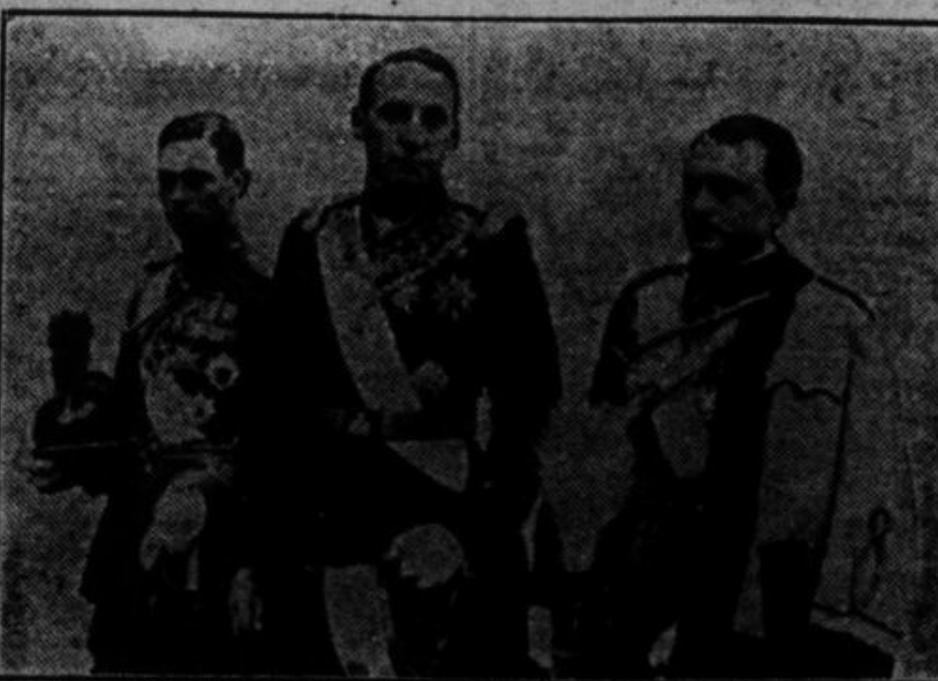
THREE ROYAL PRINCES AT ROUMANIAN CORONATION. Prince Henry, the Duke of York, the King's second son, photographed with the Infante Don Alfonso of Orleans, and Prince Paul, of Serbia, at the coronation of the King and Queen of Roumania.

PROBS:—Sunday, fair and mild, rain at night.