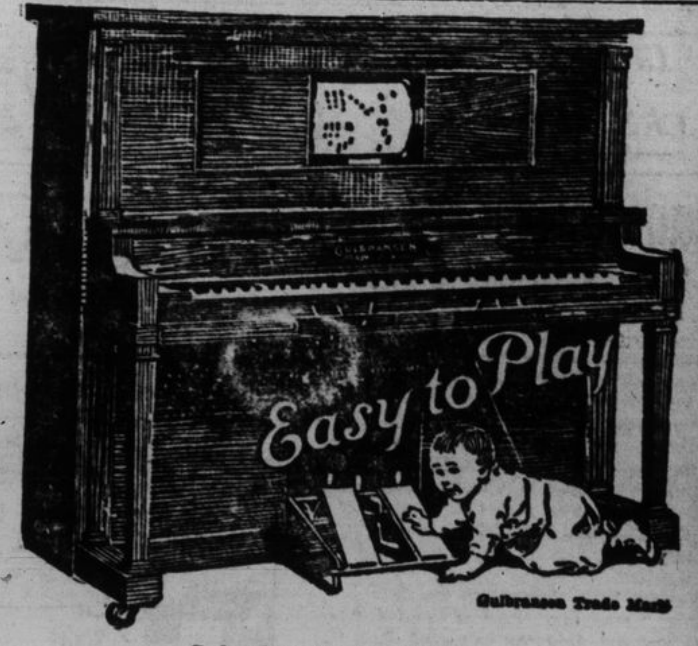
Suburban Model, $695.