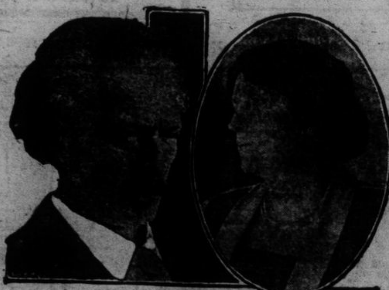
JAN IGNACE PADEREWSKI

know of a woman who always gets her designs in that way. You know linoleum and wall paper manufacturers often employ the finest artists to make their designs—so could really do no better than copy them in your rug-making. Tomorrow—Have You Tried These Pickles?