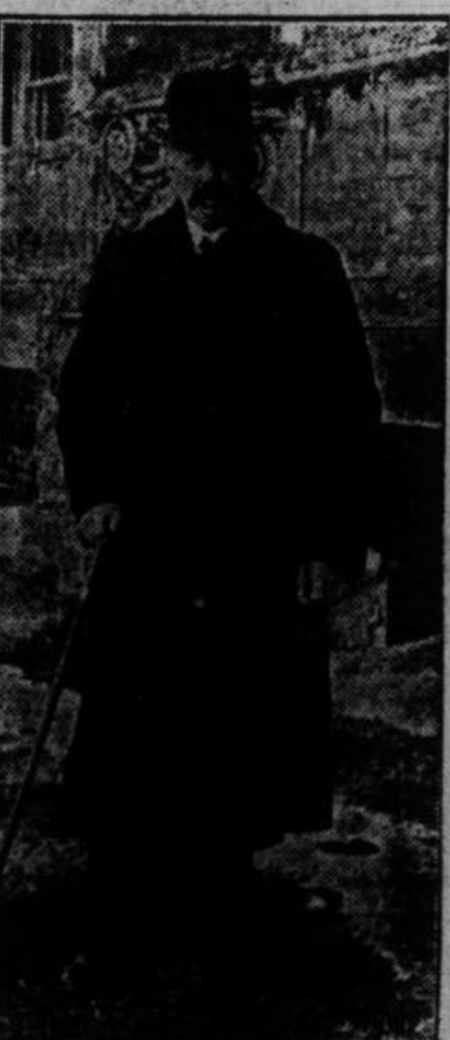
THE DUKE OF DEVONSHIRE Canada's former Governor-General is expected to be appointed as President of the Council in Bonar Law's cabinet.