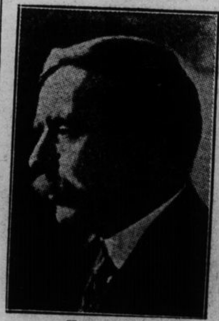
H. G. WELLS As Labor candidate for lord rectorship of Glasgow University, he asks support of students as "great symbolic act" in favor of the Labor party.