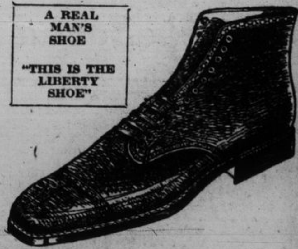
A REAL MAN'S SHOE "THIS IS THE LIBERTY SHOE"