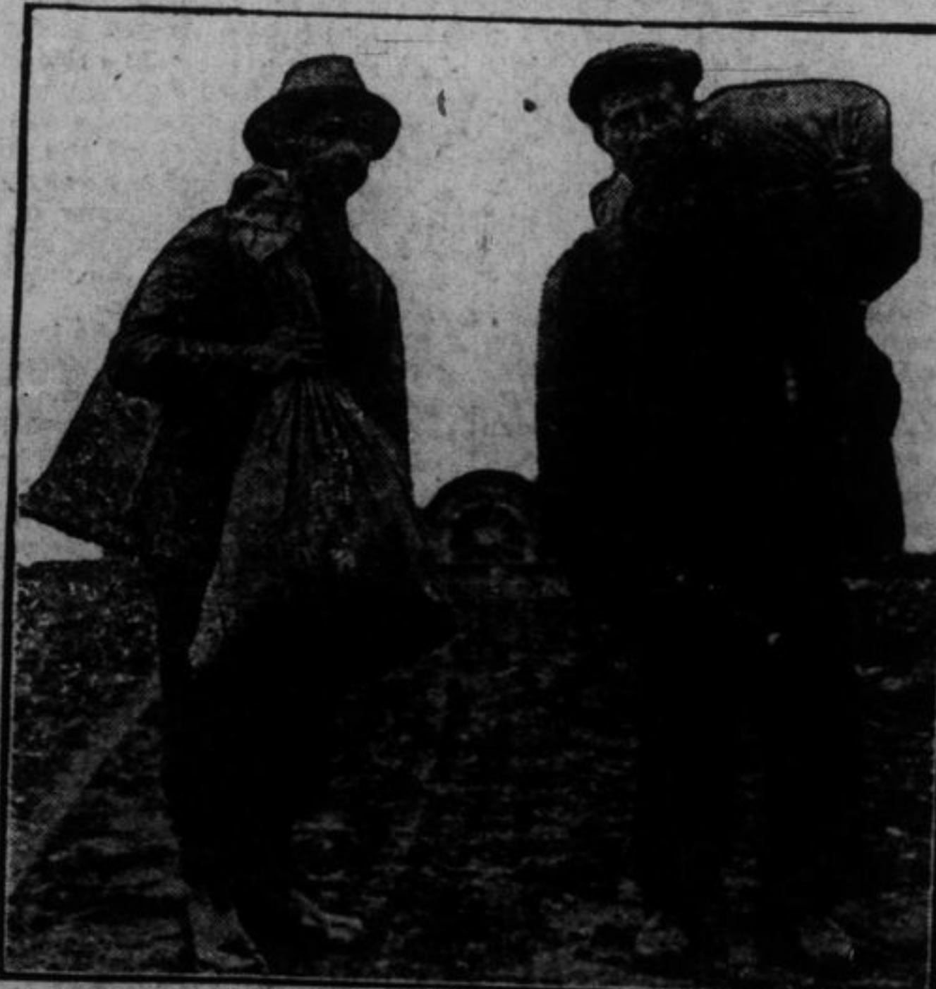
ALL THEY HAVE.

Best family physic. Do not gripe or cause pain. Purely vegetable, easy to take. 25c.