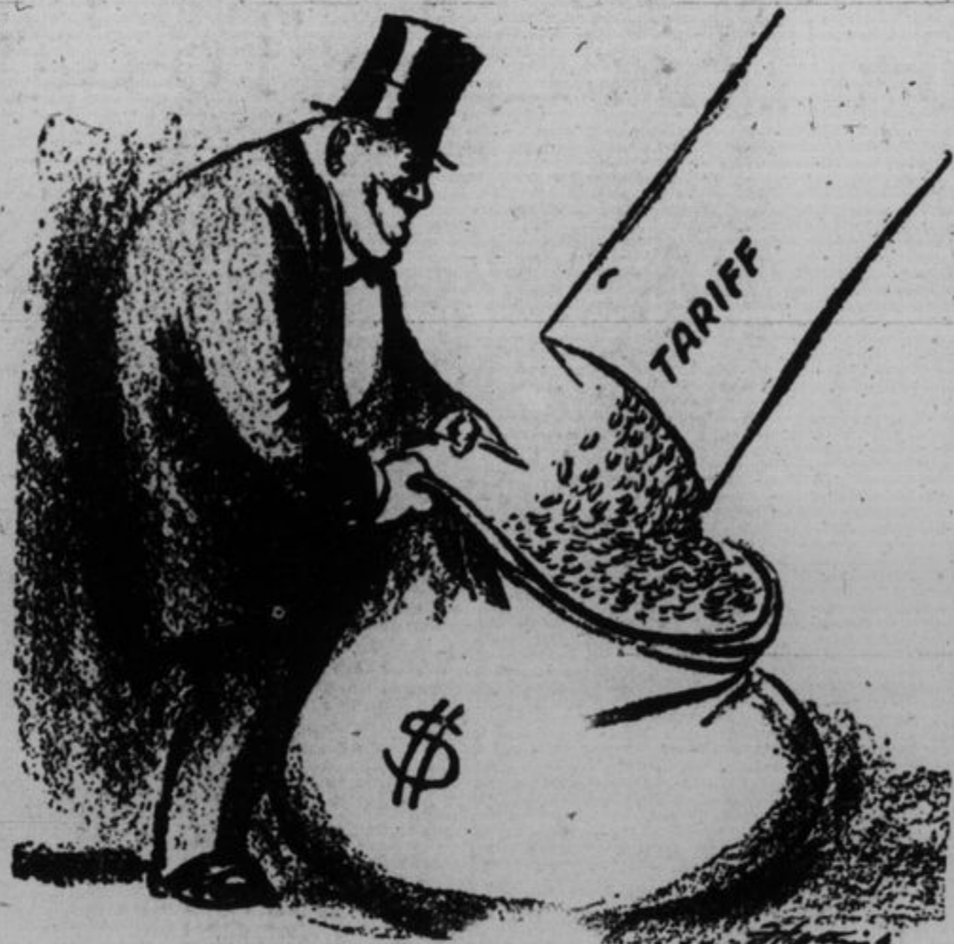
EVENTUALLY, WHY NOT NOW?

75-79 BROCK STREET If Off Your Route It Pays To Walk