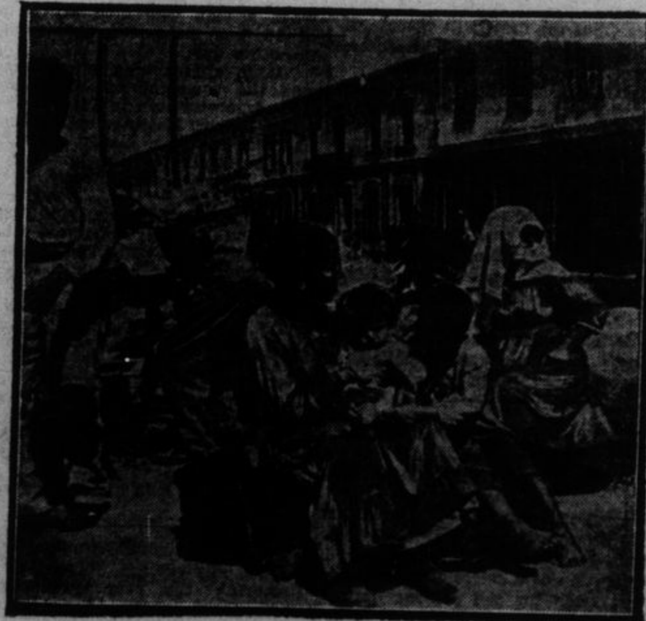
Greek refugees awaiting rescue on docks of Smyrna.