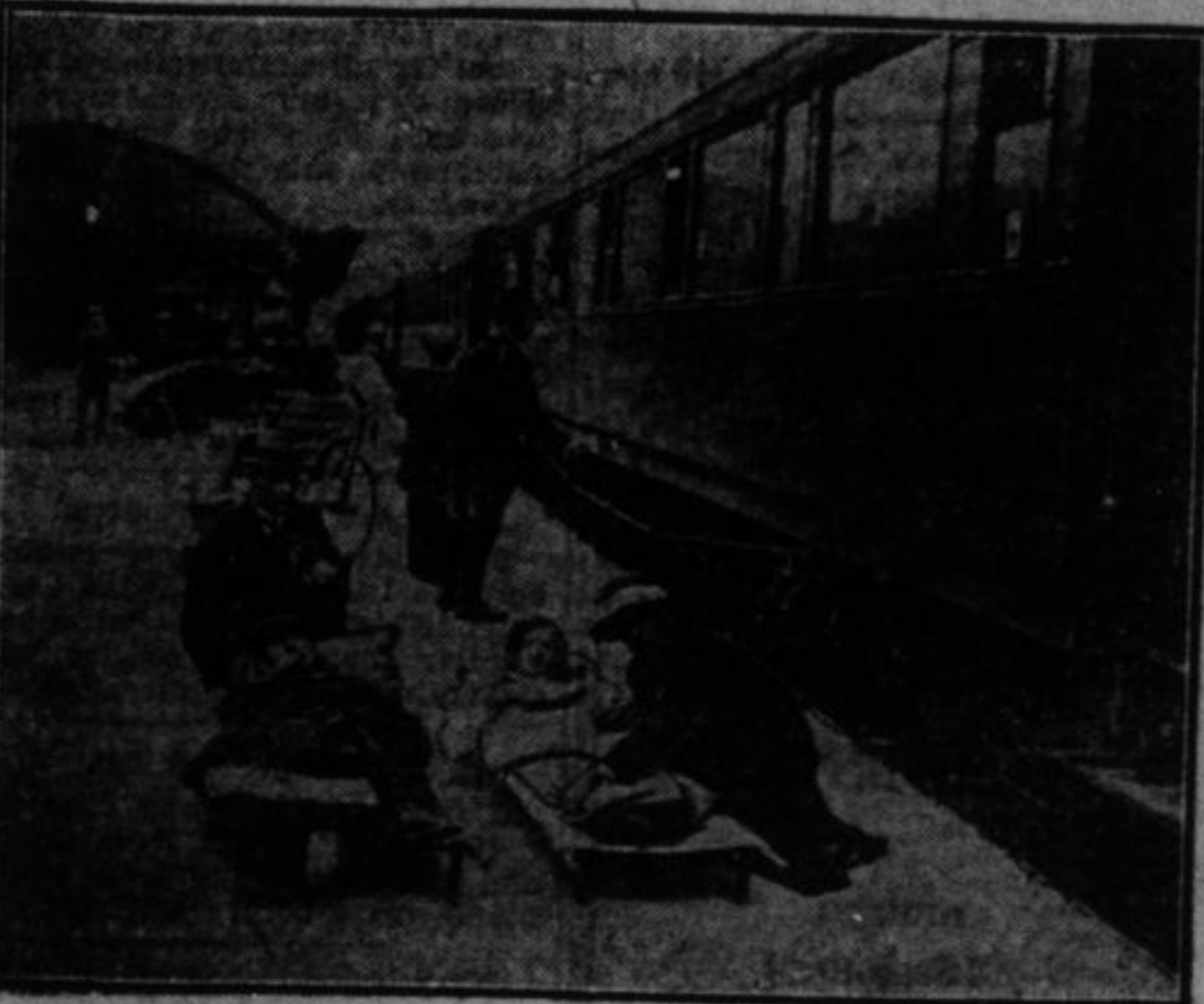
Cripples arriving at Loudres, France, hoping for a cure at the famous shrine there.

FOR THAT HOUSE YOU INTEND BUILDING SEE OUR STOCK OF