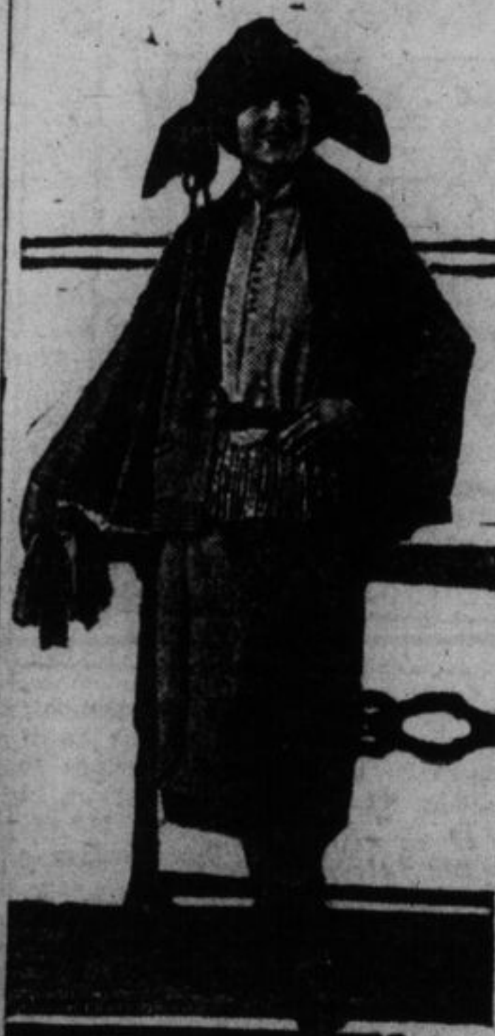
Black Net Silk Faces the Collar and Tuxedo Front of This Coat Suit.

There is no denial that the three-piece frock is selling extremely well, and there is also a strong demand for