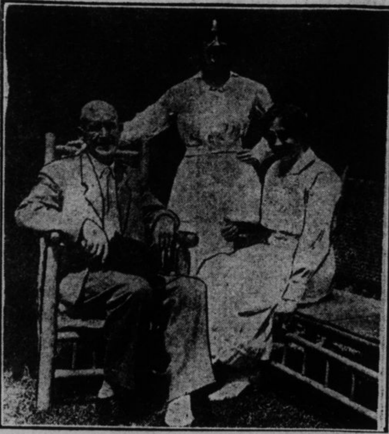
Eugene Debs enters a sanitarium. He seeks a cure for insomnia.