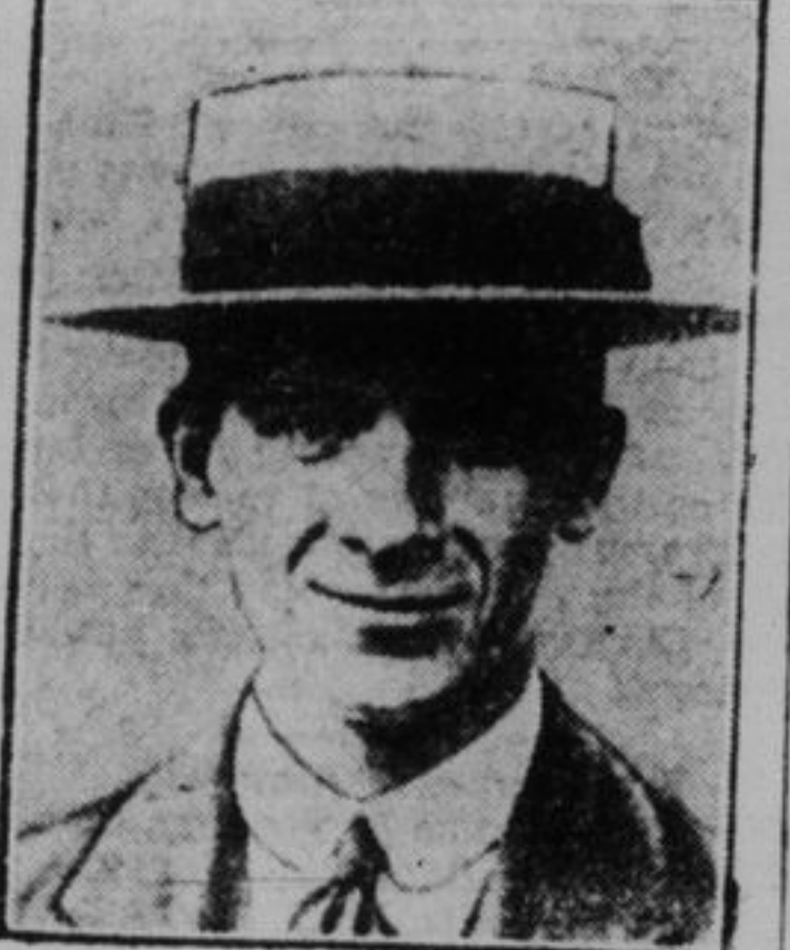
HUGHES A British soldier, blinded during the war, bumped into a lamp post at Southampton, and the shock restored his sight.

BY SAM HILL. Ho, Hum! At all reduction schemes The super stout will only scoff; For flesh rolls on, she finds, Though she tries hard to roll it off.