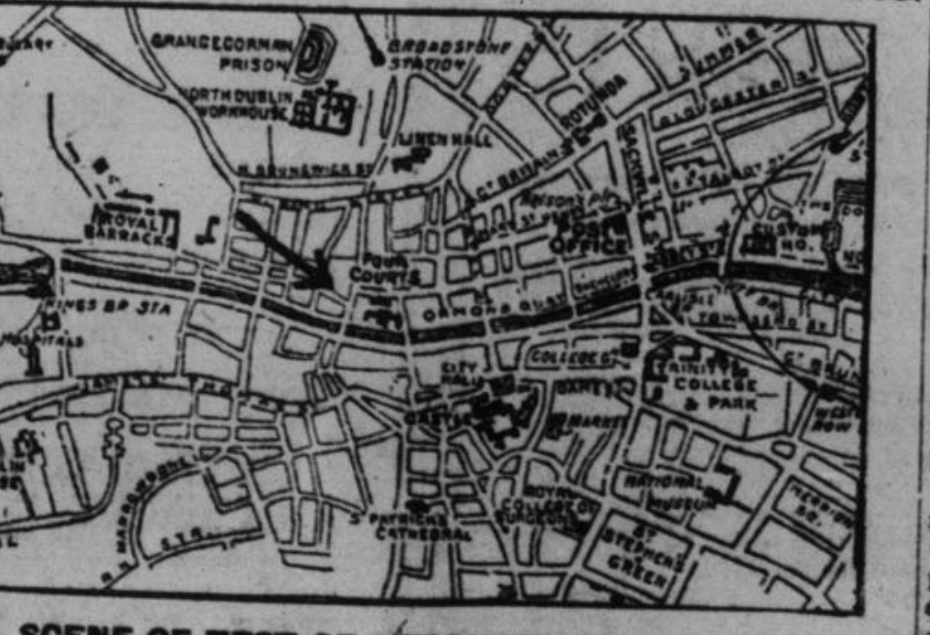
SCENE OF TEST OF STRENGTH IN DUBLIN. The battle in Dublin on Wednesday was right in the centre of the city. The arrow in the above map points to the location of the Four Courts.