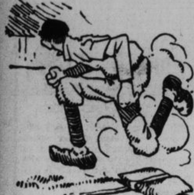
Art. Quinn Called It a Day, After Stealing Four Bases.

The Tanners yielded first place in group "B" to the hard-hitting Plumbers, by losing the Mercantile fixture on Monday by the score of 9 to 2.