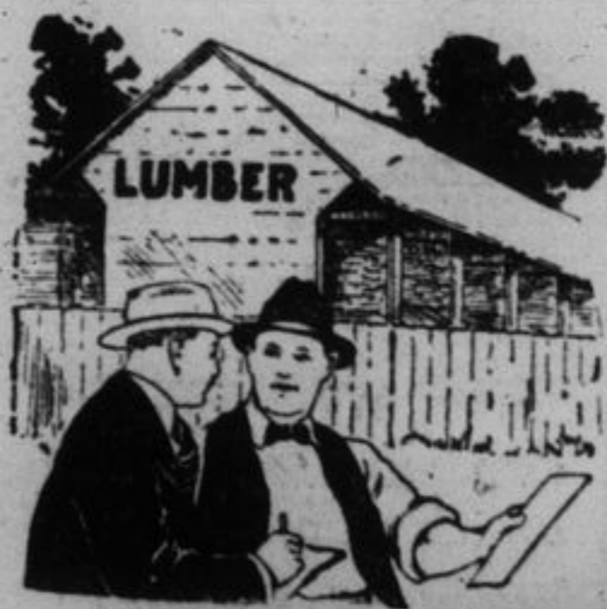
FIGURE WITH US

connection may be as shown in the illustration. The buzzer then acts as a miniature testing machine, when the push button is pressed, and the crystal can be adjusted until a maximum sound is heard in the head set-phones.