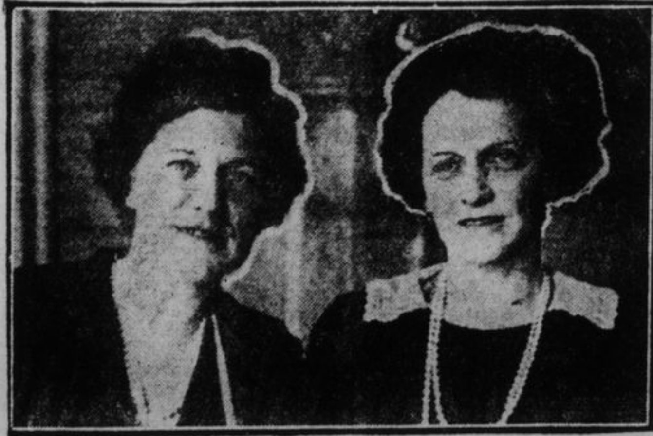
Lady Astor, right and her sister, Mrs. Charles Dana Gibson of New York.