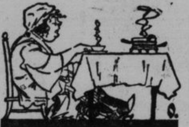
AN OLD STORY There was a young lady named Jane, A tall slender good looking dame, Before she was married, she was stylish and neat And quite fascinating, and ever so sweet, But after she wedded, I know that you've guessed, She grew fat and careless-like-meet of the rest.