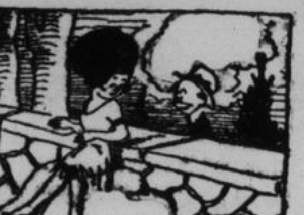
He: Your pose reminds me of a dainty little dry ad. She: Dry ad? I'd rather pose for anti-prohibition ad.