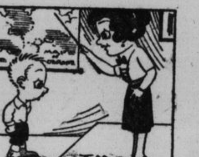
HEARD IN SCHOOL Teacher: Bound Germany. Young America: Better wait until the map gets its bumps straightened out.