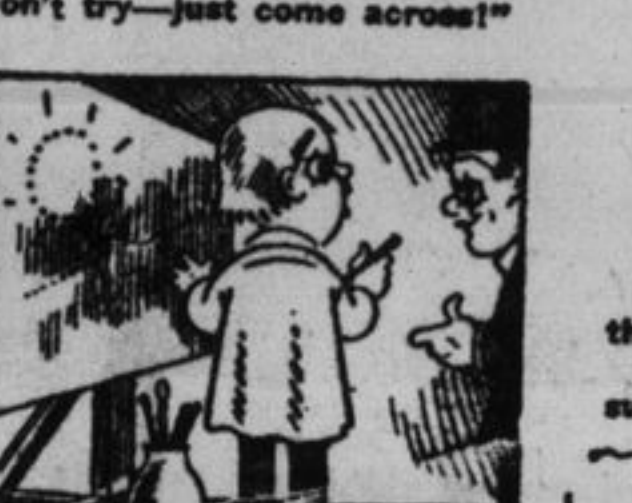
NOT WELL ACQUAINTED "I am wedded to my art." "Evidently you didn't have a long engagement."