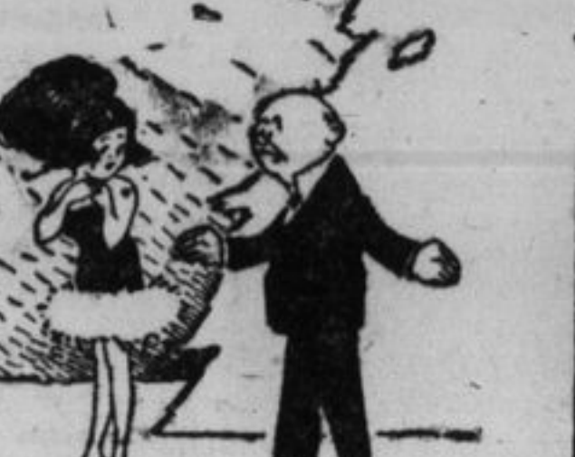
TOO SMALL Manager: You don't get any kick into your act. Soubrette: Well, there's plenty of kick about the salary I get.