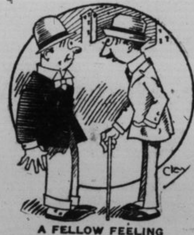
A FELLOW FEELING "A man has run away with your wife." "He has my sympathy; I eloped with her, myself."