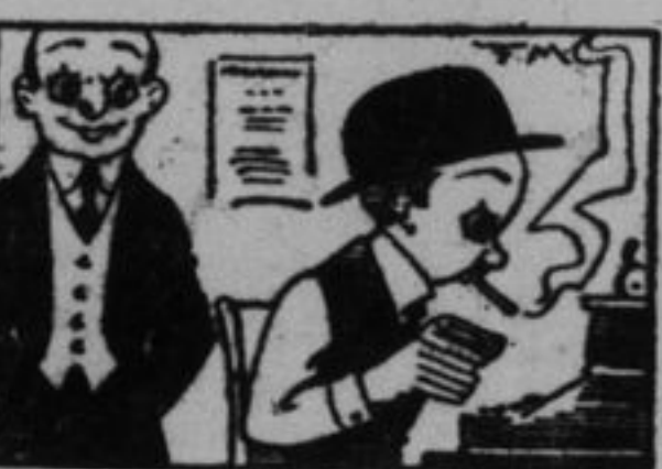
WOMAN IN JOURNALISM "Where is the new society reporter?" "She has gone to the drug store to get some 'local color.'"