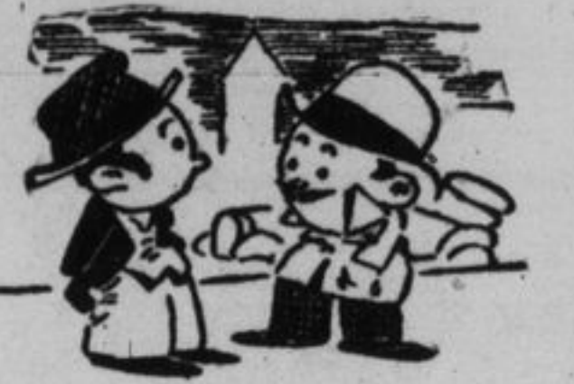
UP FOR REPAIRS Superlat: Old Speedix is in the hospital. Had a bad spill in his car and lost an arm and a leg. Timpan: Too bad! But I suppose they keep a good stock of spare parts at the hospital.