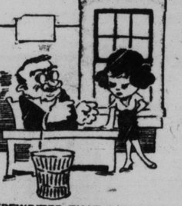
TYPEWRITER THAT COULD BE CARRIED "Why did you hire me, the smallest girl among the applicants, for your stenographer?" "The last one I had weighed one hundred and sixty pounds and when she fainted one day and I had to carry her out of the room for air, I decided to have a portable typewriter."