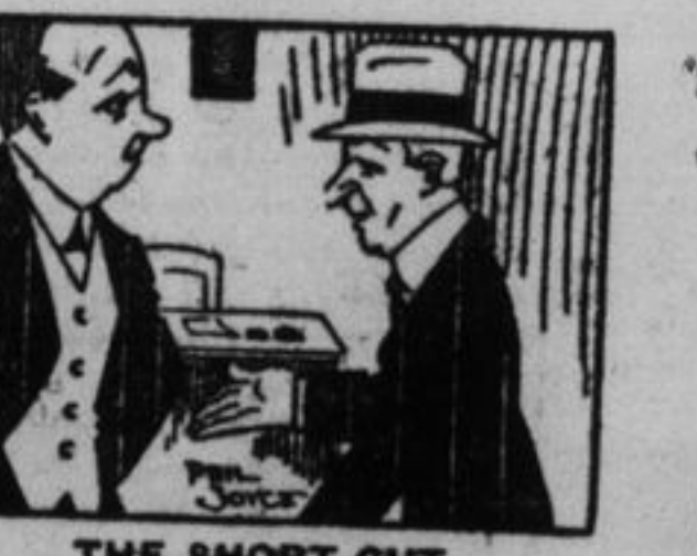
THE SHORT CUT "I don't know how to get around this difficulty of paying your bill." "Don't try—just come across!"