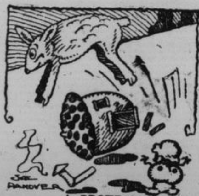
A PROTEST Mrs. Bug: Hey, you fool spring lamb; you've knocked my house over!