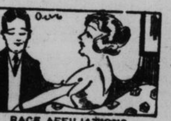
RACE AFFILIATIONS "They are as far apart as the poles." "Don't the Poles get together as well as the Swedes?"