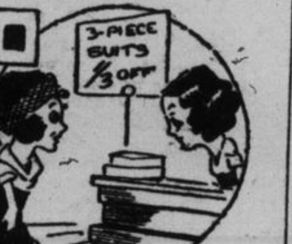
A MARK-DOWN SALE "These three-piece suits are one-third off." "Then I suppose these two-piece suits are one-half off."