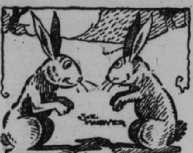
AS EASTER APPROACHES Rabbit: I suppose we have to listen to that fool story about the Easter Bunny now!