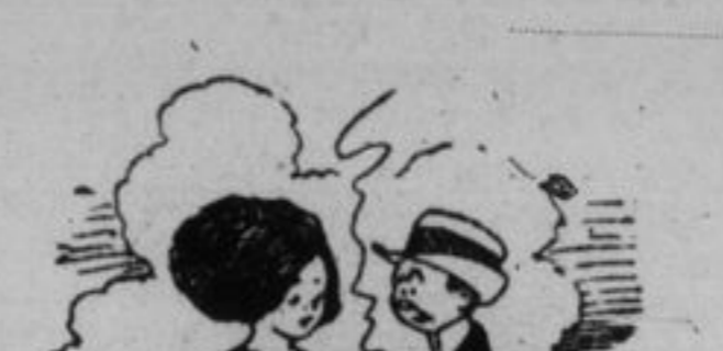
"Do you think you could love a feller like me?" "If I knew what you were like, maybe I could."