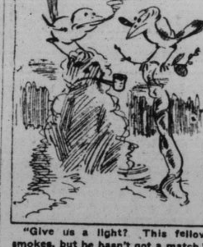
"Give us a light? This fellow smokes, but he hasn't got a match."