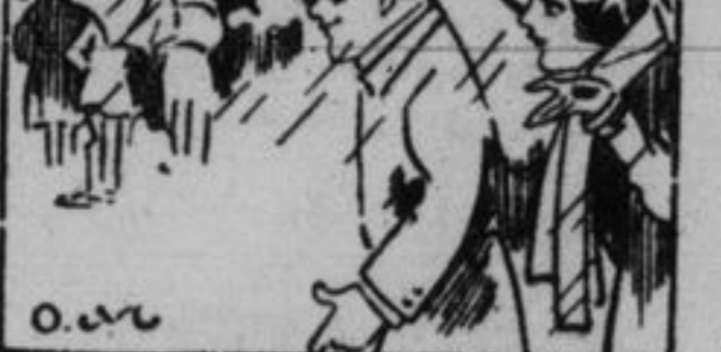
"I wish these bugs would get together on the time question." "It is awkward; I was going to an evening function out of town and I put on evening dress, but when I arrived, I found that it wasn't six o'clock."