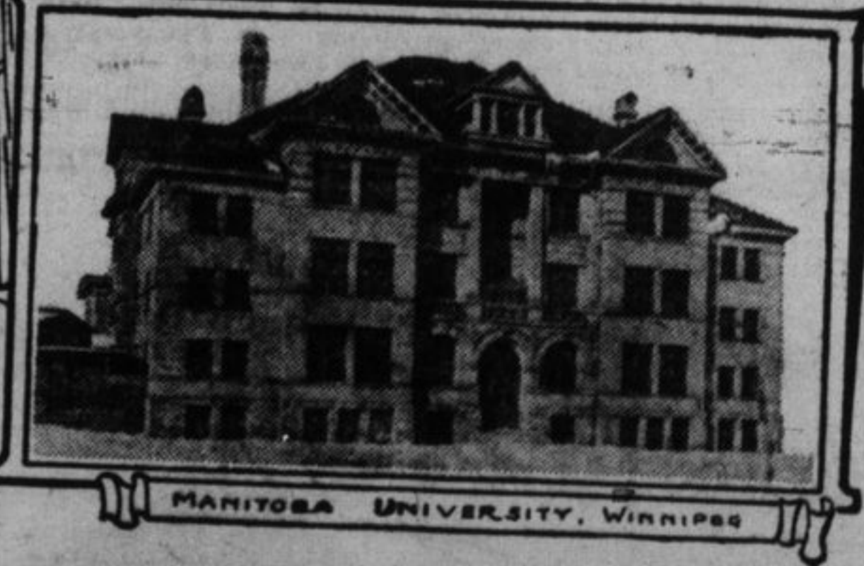
MANITOBA UNIVERSITY, WINNIPEG.