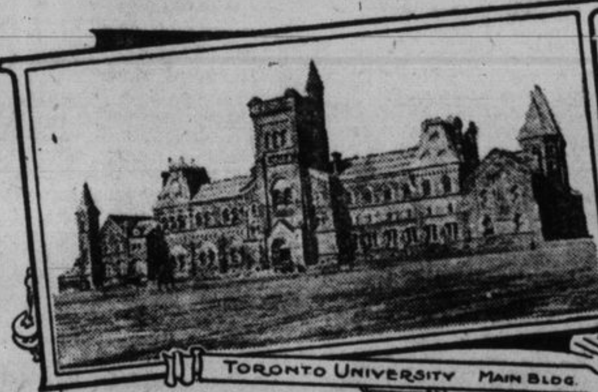
TORONTO UNIVERSITY MAIN BLDG.