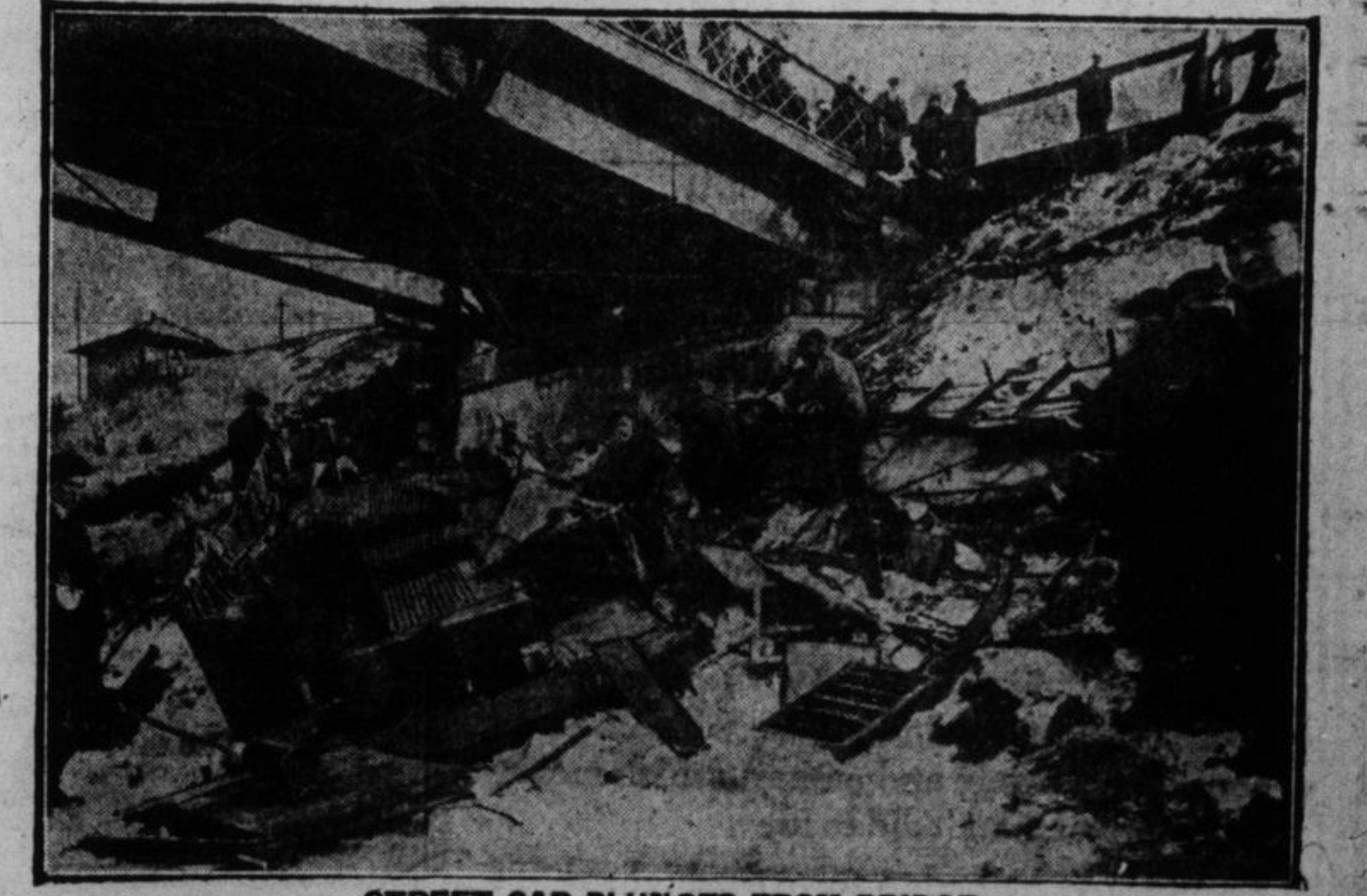
STREET CAR PLUNGES FROM BRIDGE. Ten people were seriously injured at Saskatoon when a car jumped the track and went through a bridge. Picture shows the debris.

Deep down in the heart of every girl—no matter who she is—the dream of Prince Charming. The vision of him may rise, float up from the pail of warm water with which she is rig what the way may be, for the dream is always rising from the hearts of youthful Cinderellas everywhere.