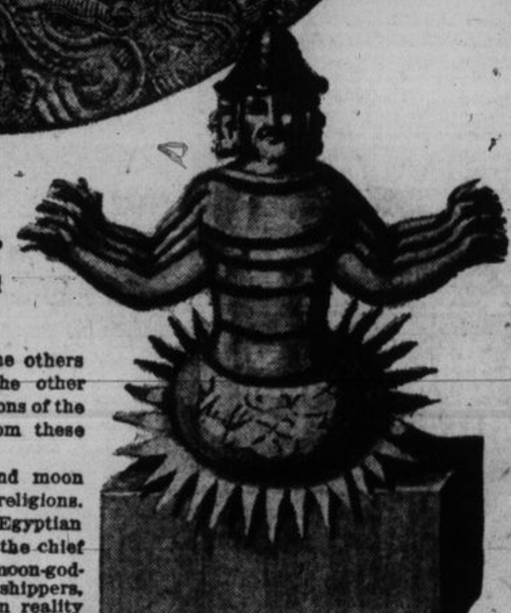
The Oriental Picture of the Sun-God Whose Eight Arms, According to the Brydlovan Theory, Represent the Eight Divisions of a Circle.

Among the most familiar flowers we find many of the five-petaled variety, such as the petunia, phlox, morning glory, jasmine, trumpet vine, begonia, pansy, cherry blossom, wild rose, marsh marigold, buttercup, forget-me-not and nasturtium.