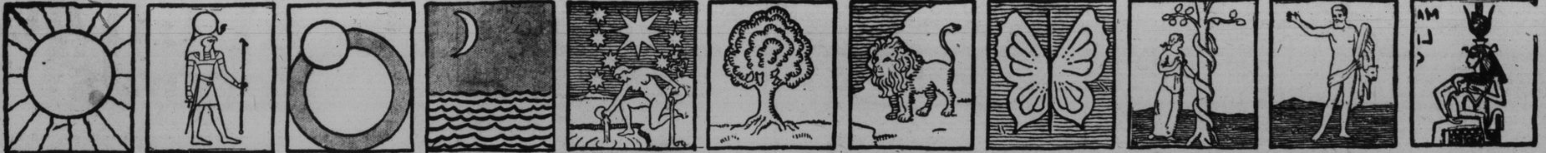
The Sun, Symbolized by a Perfect Circle. The Sun-God, Symbol of Masculine Deity. The Path of the Sun Through the Zodiac. The Moon and Its Influence on the Tides. The Stars—from an Old Tarot Card. Vegetable Life, Symbolized by a Tree. Animal Life, Symbolized by a Lion. The Soul, Symbolized by a Pair of Wings. Woman, Symbolizing the Female Element. Man, Symbolizing the Masculine Element. Moon-Goddess, Symbol of Feminine Deity.