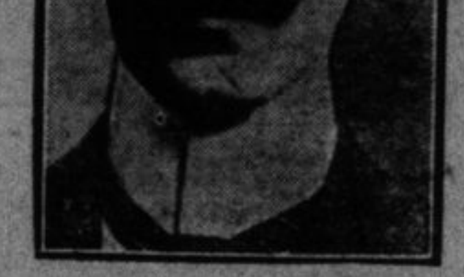
LATE LORD HARCOURT. Over whose death an inquest is to be held in London. It is declared he took his life by poison to escape a scandal.

When a wood block, rubber covered pavement on a busy London street was taken up after eight years of use it was found that the greatest wear was on the under side of the rubber.