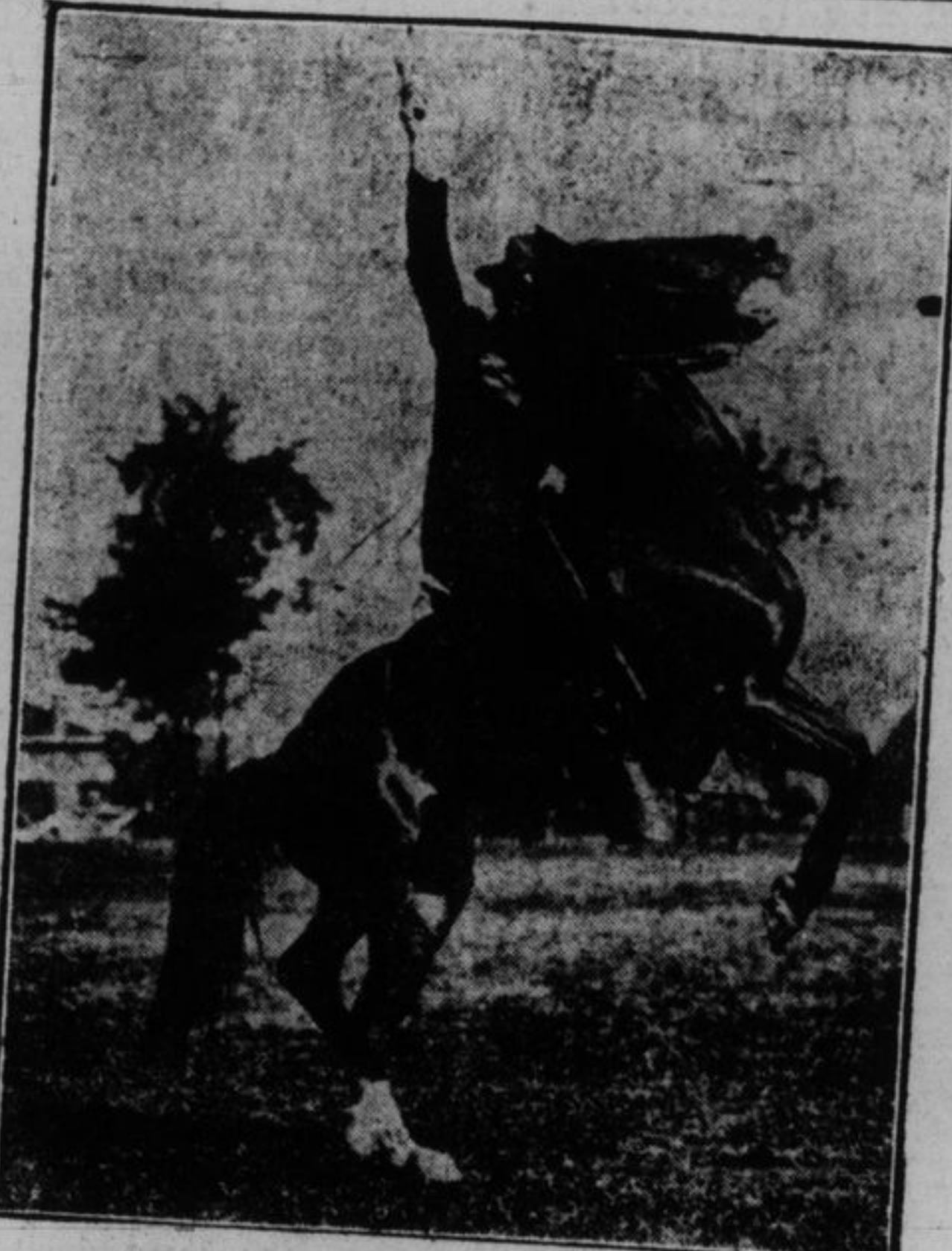
TRAINING HORSES FOR CAVALRY MOUNTS. Above is shown a horse being trained to rise at the crack of a pistol. It is one requisite in the schooling of the cavalry mount.

His Flesh Horribly Burnt His druggist sold him a cheap Acid corn remedy, instead of giving him good old reliable Putnam's Corn Extractor, which has been for fifty years the standard remover of corns and warts. "Putnam's" never fails. It is always a success. 25c. everywhere. Refuse a substitute.