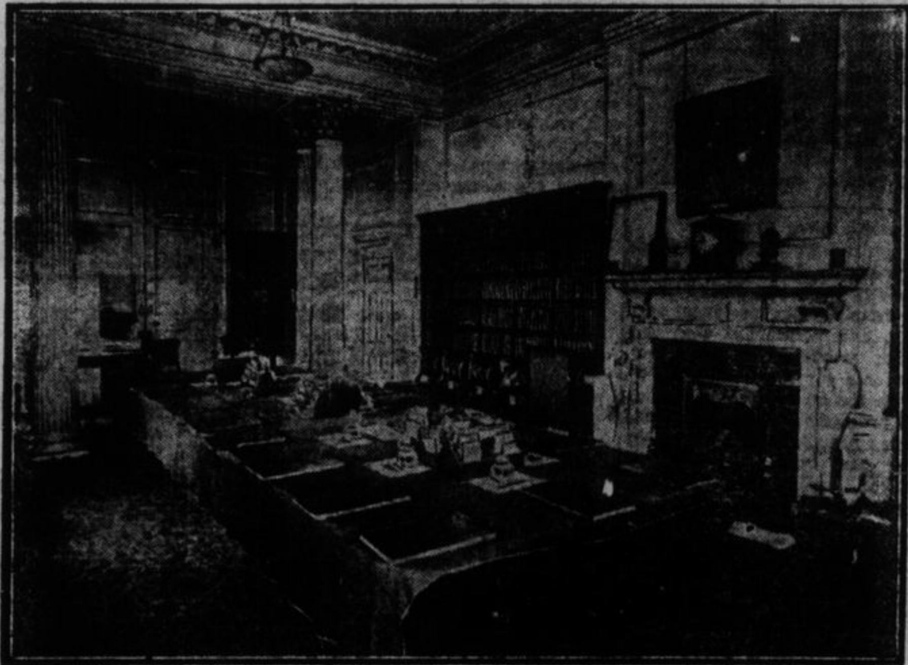
WHERE IRISH PEACE WAS SIGNED; THE COUNCIL CHAMBER IN DOWNING STREET Council chamber in the official residence of Britain's Premier, 10 Downing street, wherein was signed the articles which created the Irish Free State. In this room, too, was signed the peace treaty between Great Britain and the United States, which marked the real birth of the American republic.

Industry in Difficulties. The Eastern Ontario Milk Products Company, Limited, which located in Gananoque last year, and which was assisted by the town to the extent of providing building material, is now in difficulties and its assets are to be sold at auction on Jan. 5th.