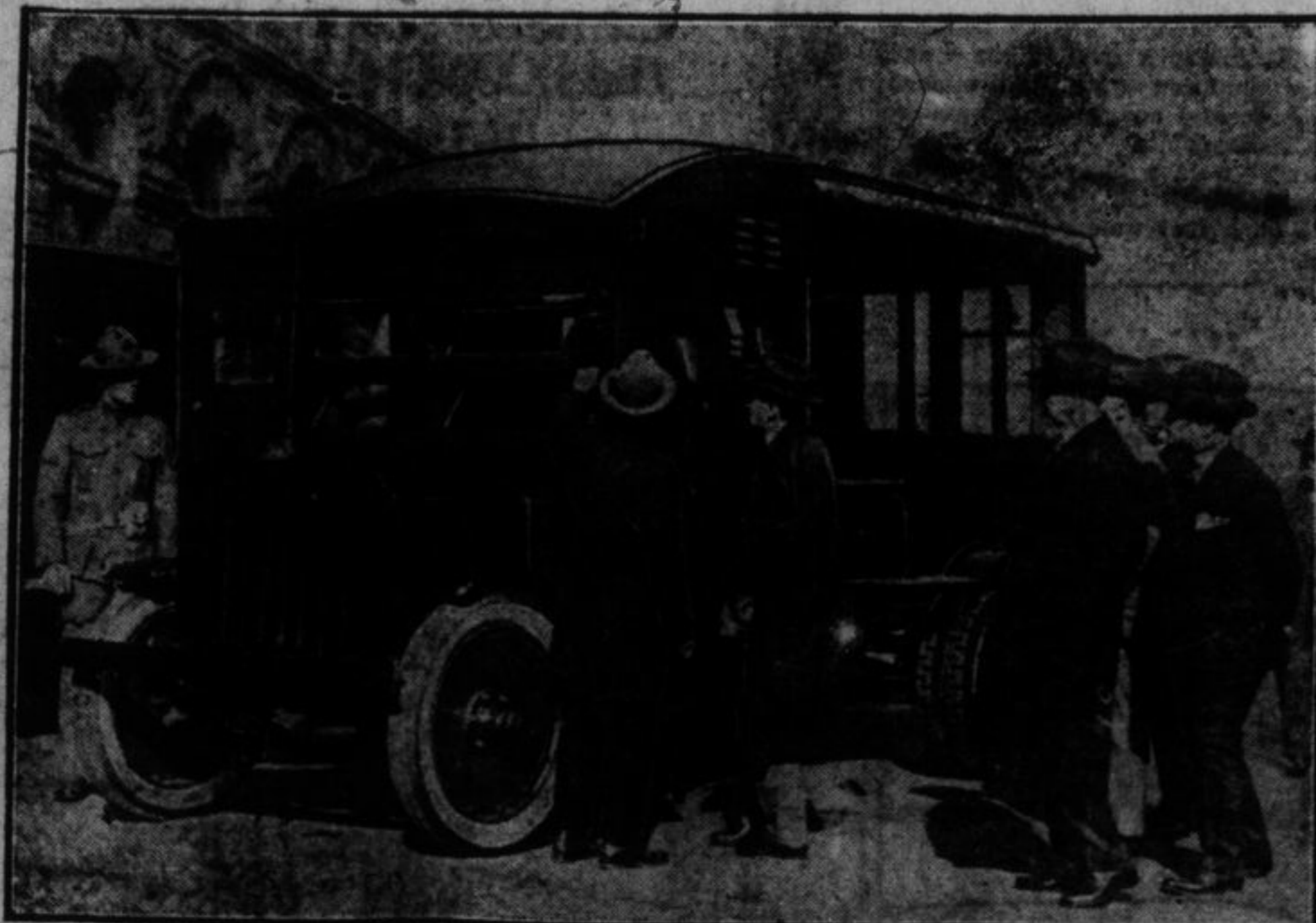
UNOLE SAM'S NEW ARMORED MAIL TRUCK IS BULLET-PROOF. The first armored U. S. mail truck makes its debut in America. It is bullet-proof and equipped with rifles. Photo shows Postmaster Hays and mail officials inspecting an armored mail truck.