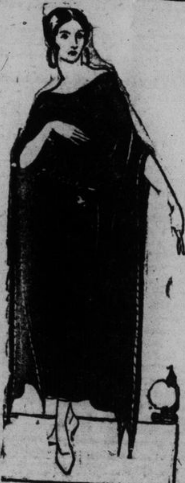
The Vogue of Black Is Emphasized in This Gown of Black Crepe.

A Man Who Married Wrong. Despite the warnings of their prophets, the Jews, a thousand years before the Christian era, had adopted the King-fashion of their neighbors. The record of three millenniums ago reads like Kipling's "The Old Man":