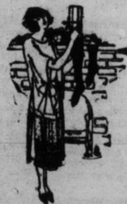
Silk Hosiery and Jaeger Wool