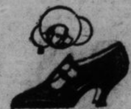
New Evening Shoes