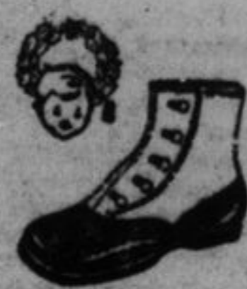
Pretty Shoes for Babies $1.00 up.