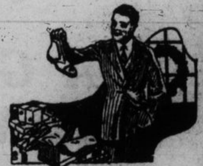
Shoes for Young Men