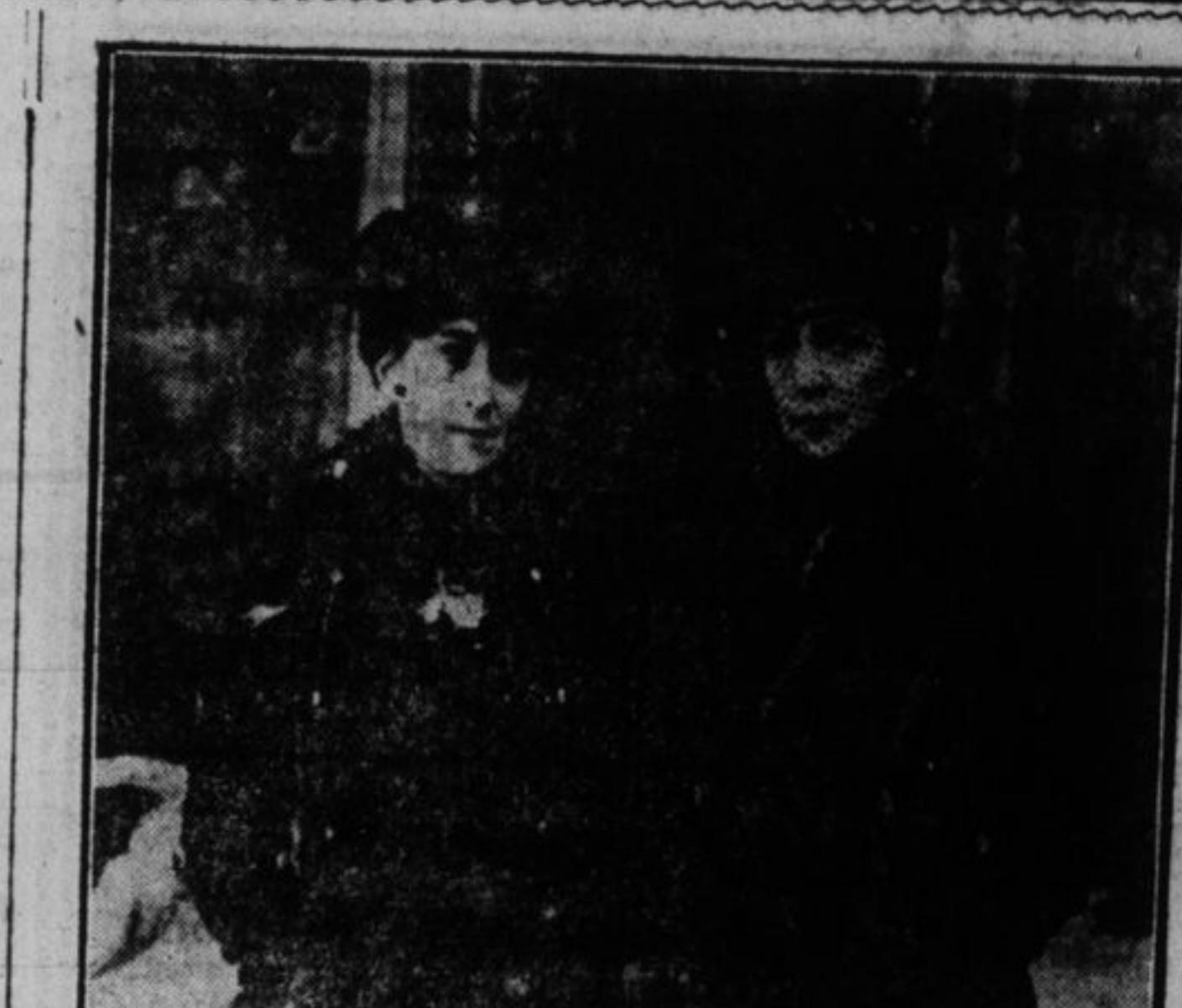
The Queen Mother and Queen Maud, of Norway, photographed during the recent visit of the latter to London. Queen Alexandra celebrated her 77th birthday a short time ago.

Calvary Is Doing Good Work. Kingston, Dec. 14.—(To the Editor): In Wednesday's Whig it is stated that the people of First Congregational church have decided to sell their church and join with Chalmers Presbyterian. It is also stated that Bethel church could take care of congregationalism in the city.