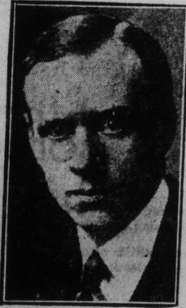
SINCLAIR LEWIS Author of "Main Street."