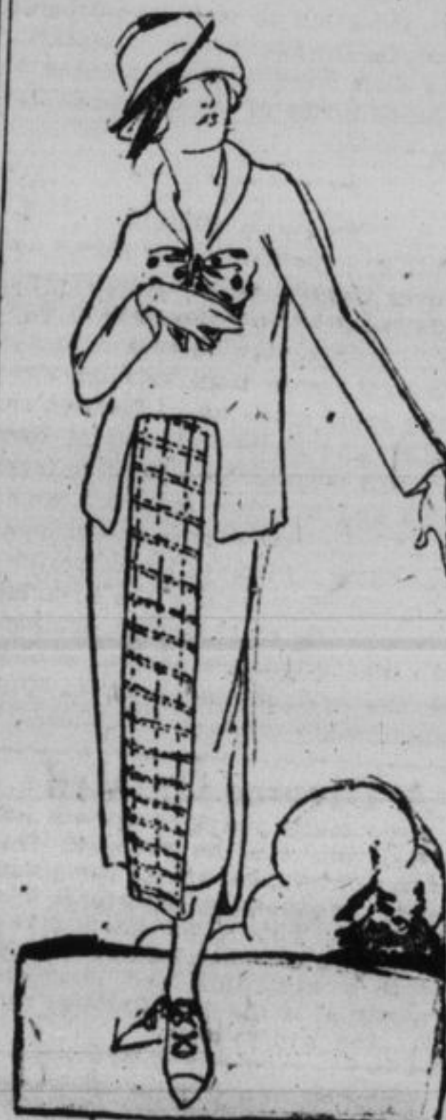
Black Stitching Trims This Suit of Green Homespun.