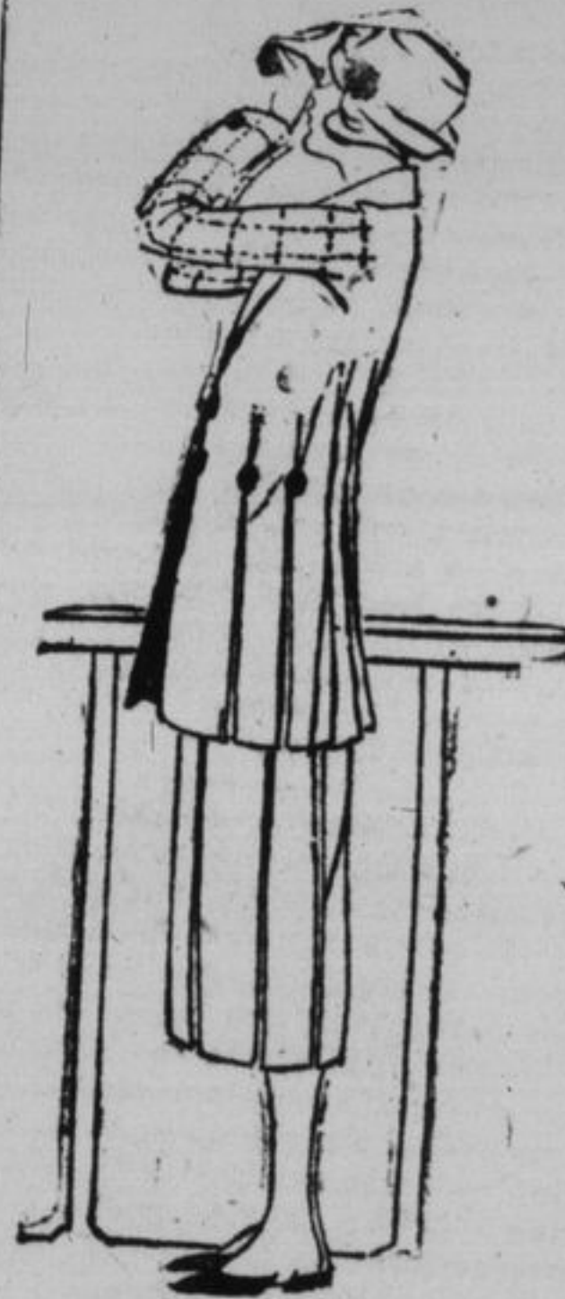
This Sports Suit Is of Lavender Tweed—the Hat of Felt.

Tweed suits in the soft tones of green, blue, rose and lavender took New York by storm last summer, and their popularity is increasing, instead of waning, with the fall. A useful addition to any wardrobe is this sport suit of lavender, and by the way, "sport suit" has come to mean the "every-day suit." The coat is literally pinched into inverted pleats. Those at the sides are further fortified by violet-colored bone buttons. The really unusual touch, though, is given by the cross-bar stitching in white on the sleeves. A box-pleated skirt gives freedom for the necessary movement, and a youthful hat of lavender felt adds a cockade of ribbon to its upturned brim.