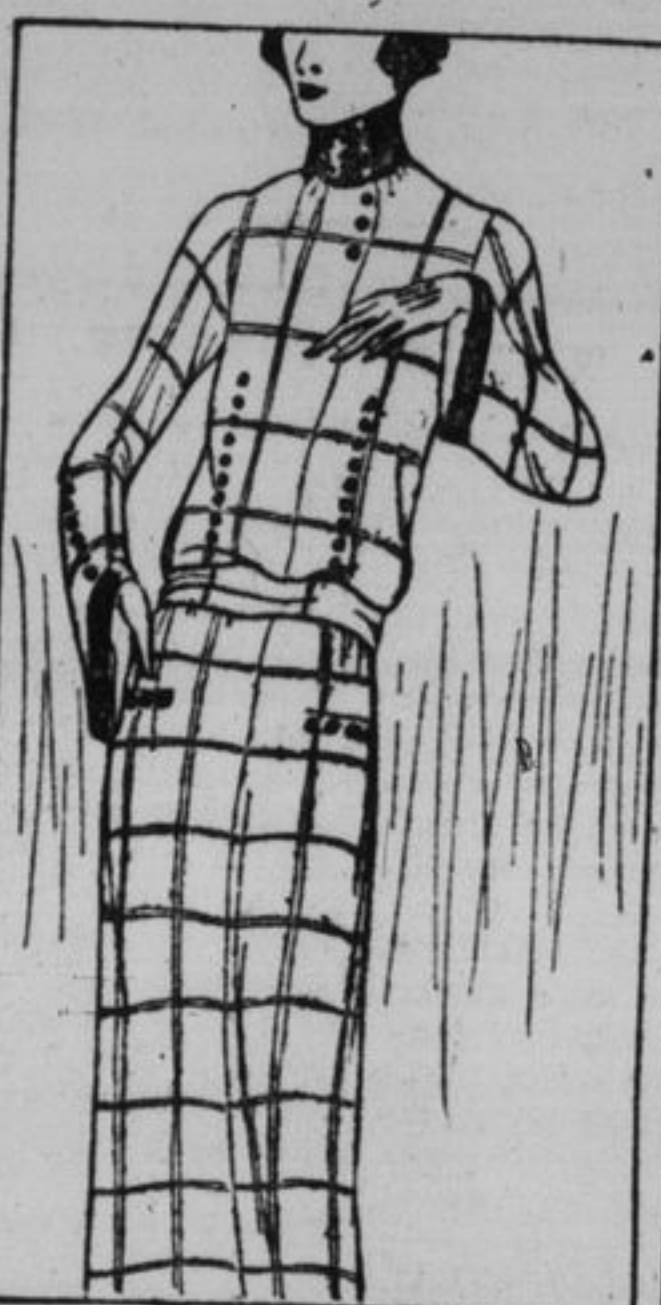
Winsome Russian Blouse Style of Woven and Embroidered Material in Green and Yellow Plaid.

The same maker has brought out a coat of a slightly more dressy type made of blue repp and trimmed with