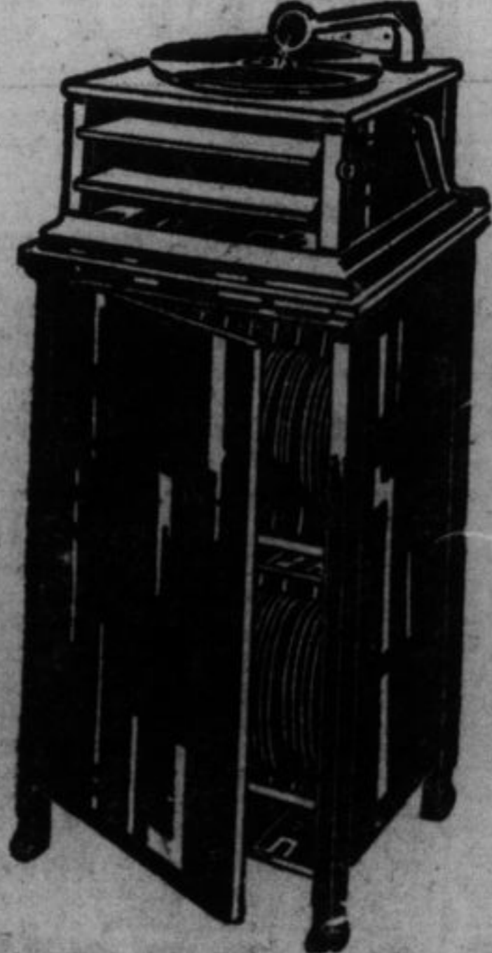
Style A or B—complete with Cabinet, 10 Selections, Needles, Oil, Brush, etc., on easy Christmas Club Terms.